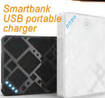
Smartbank USB portable charger

Google Nexus 5. The smart, new phone made to capture the moments that matter.