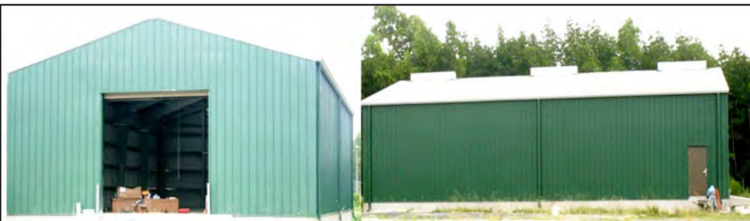
1. BRAND NEW WAREHOUSE FOR RENT, SIZE IS 40FT X 70FT LOCATED AT THE EAST SIDE OF AIRPORT TERMINAL.