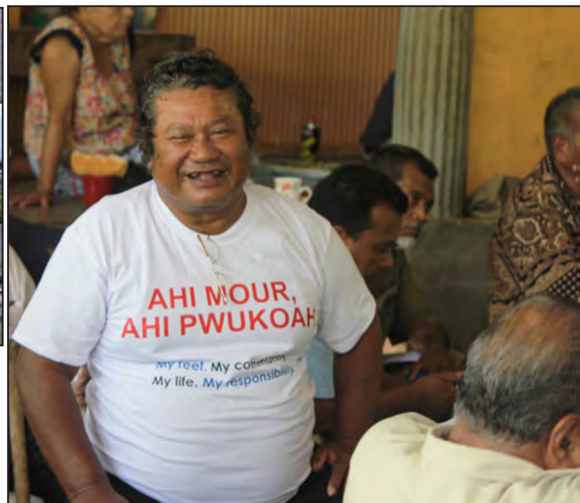
Pohnpei Marine Advisory Council Representative