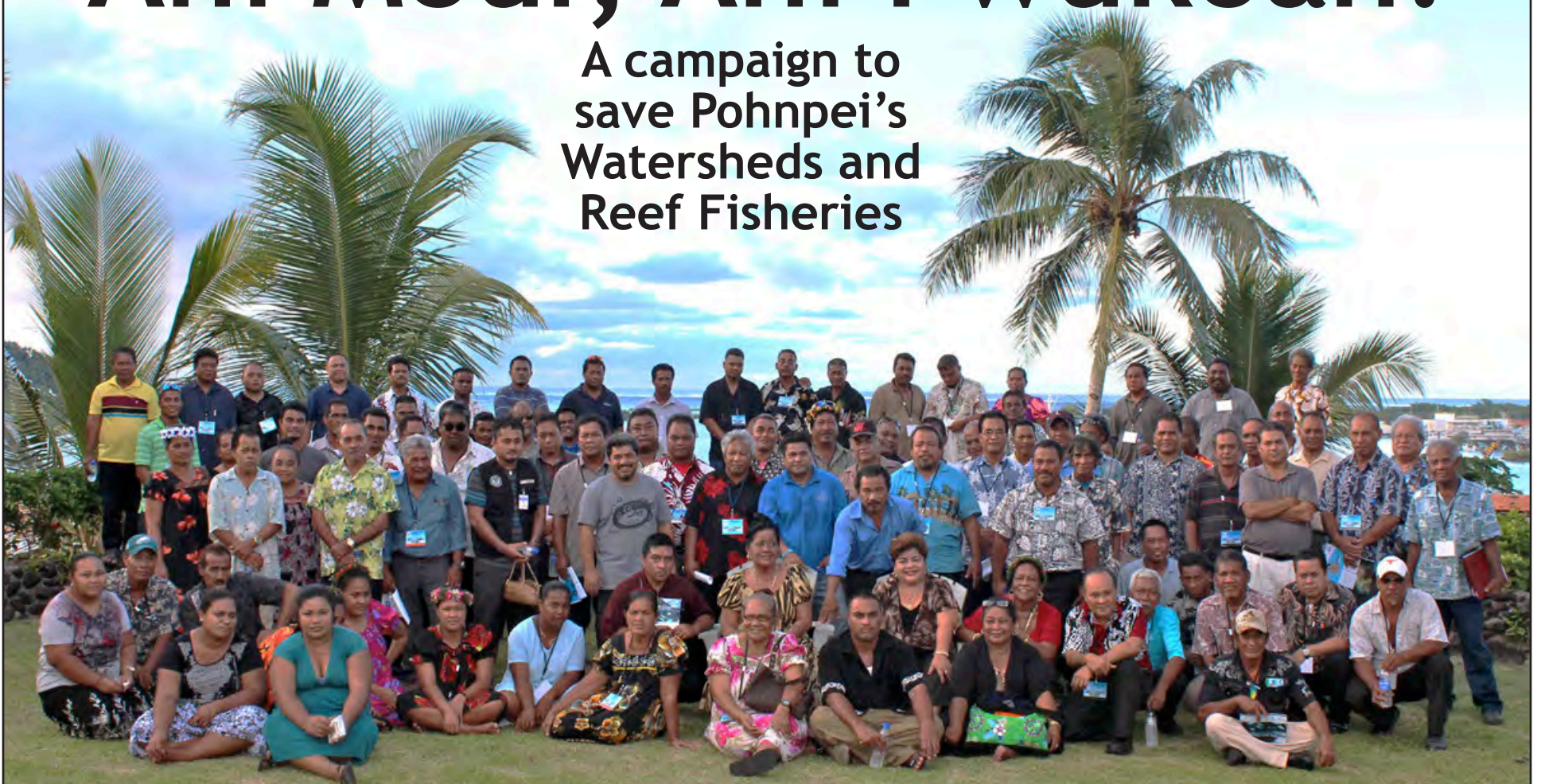
Pohnpei State Local Council Government Summit group

A campaign to save Pohnpei's Watersheds and Reef Fisheries