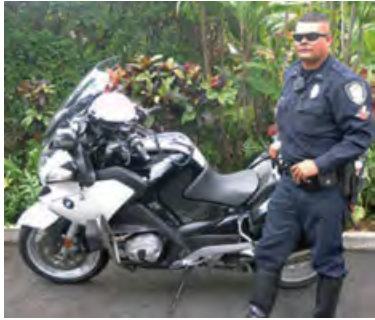
The Friend Newspaper