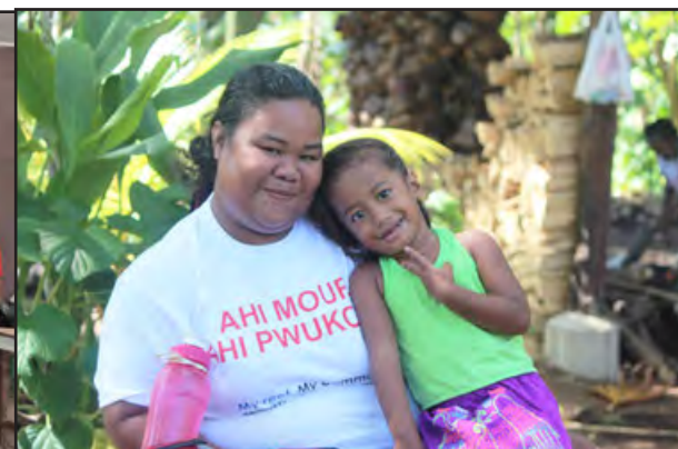
Mother and daughter in Kitti

The Working Group will continue to campaign in all the municipalities in Pohnpei and with other stakeholder groups. The Working Group is also collaborating with the Pohnpei Women's Council, which has adopted the Ahi Mour, Ahi Pwukoah theme for this year's International Women's Day celebrations on March 13, 2015.