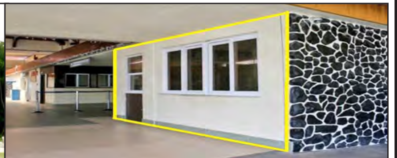
2. CONCESSION SPACE AVAILABLE FOR RENT NO: TC-4 SIZE IS 127.68 SQUARE FEET LOCATED AT THE DEPARTURE SECTION OF THE AIRPORT TERMINAL.

Pohnpei Port Authority is soliciting to all interested businesses/Individuals proposal to lease the above warehouse and a terminal concession state above. All proposals will be accepted starting 02/27/15 to March 15, 2015.