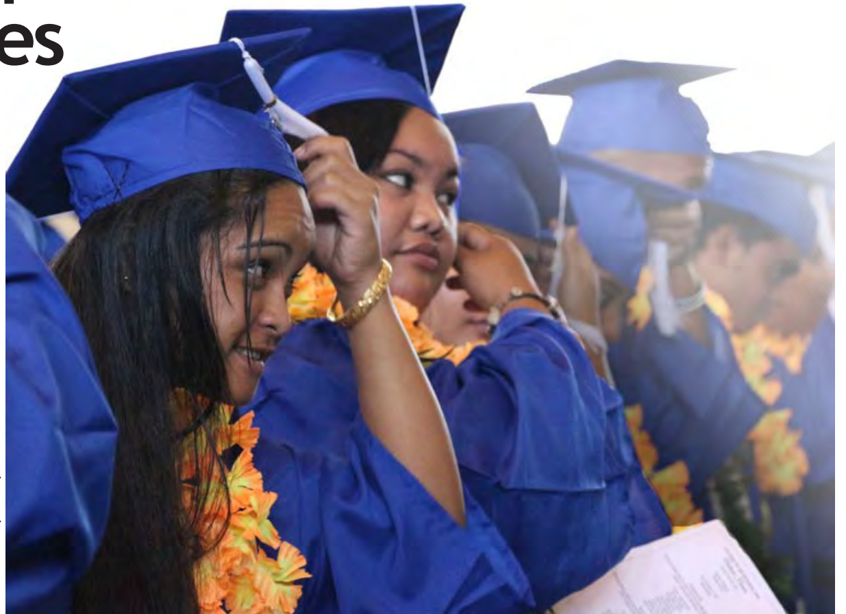
New graduates flip the tassel from right to left after graduation ceremony