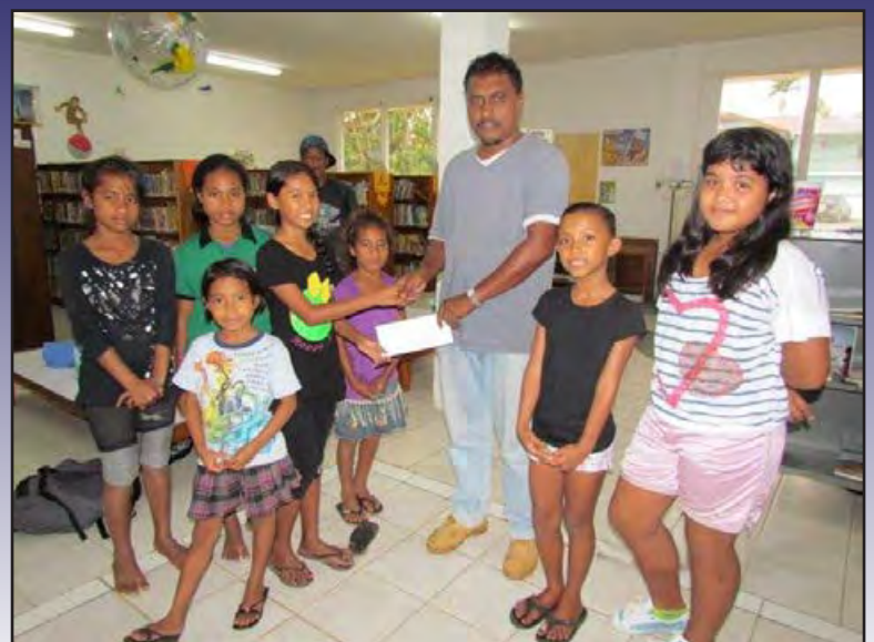
At the Pohnpei Public Library. Money raised during the Best Buy and Ocean View Fishing Club fishing tournament