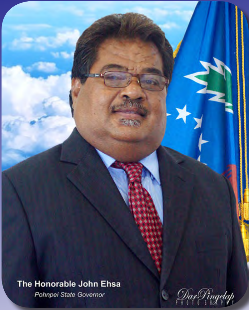
The Honorable John Ehsa Pohnpei State Governor