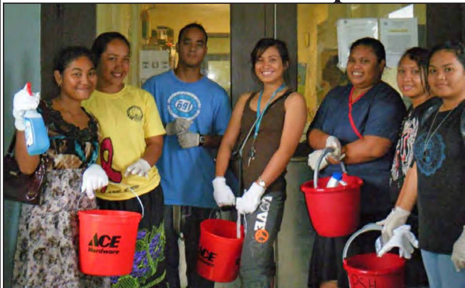
Students from COM-FSM Nursing program supported in the year-end clean up in the hospital