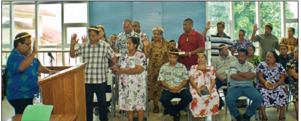
Governor Ehsa swears in new Sports Commissioner

Governor Ehsa challenged the members of the boards and commissions to “think outside the box.”