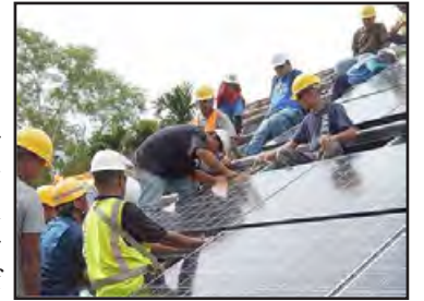
OJT Training of Soft Component by PUC Staff

The Government of FSM commenced "The Project for Introduction of Clean Energy by Solar Electricity Generation System in the FSM" in November 2011, under the Government of Japan's Program of Grant Aid for Environment and Climate Change in cooperation with the Japan International Cooperation Agency (JICA). The project is to promote clean energy utilization and achieve emission reductions by installing photovoltaic systems connecting to the Pohnpei State grid of power supply. The Division of Energy, FSM Department of Resources and Development, headed by Mr. Hubert Yamada, is the primary responsible department for implementing the project and since then has been coordinating all parties concerned, which include Pohnpei Utilities Corporation (PUC), College of Micronesia (COM) and FSM Department of Transportation, Communication, and Infrastructure (TC&I). A consultant firm from Japan, Yachiyo Engineering Co. Ltd. has been supervising the quality of work, implementation schedule and safety of the construction sites.