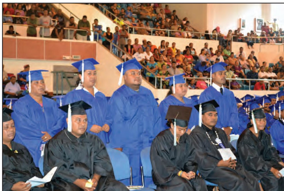
College of Micronesia-FSM