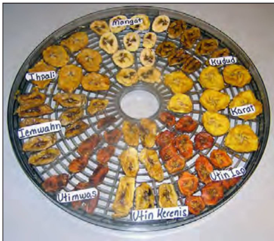
Banana varieties after drying

By Chizuru Seki (JICA) Island Food Community of Pohnpei