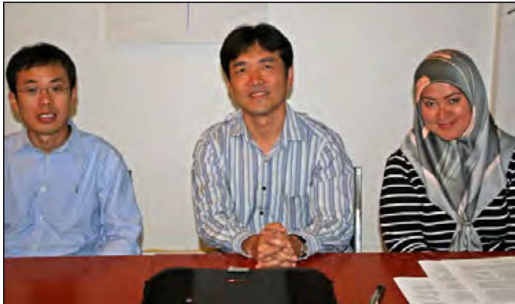
The International Monetary fund mission at their closing press conference

The report said that as a result of moderating food and fuel prices in the