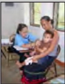
See page 8