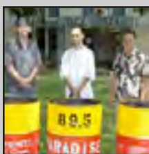
See page 3