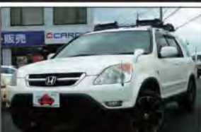
Ref.28726 PRICE: $4,600 HONDA CR-V Year 2002 AT 1,998cc PETROL Mileage 92,000km Color Pearl