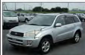
Ref.28334 PRICE: $5,000 TOYOTA RAV4 Year 2000 AT 1,990cc PETROL Mileage 85,000km Color Silver