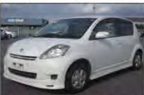
Ref.28179 PRICE: $2,360 TOYOTA PASSO Year 2007 AT 990cc PETROL Mileage 82,000km Color White

*Price Include Car Cost & Freight up to Pohnpei, Yap, Kosrae or Chuuk