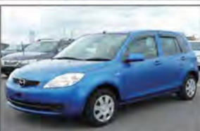
Ref.28499 PRICE: $2,640 MAZDA DEMIO Year 2007 AT 1,340cc PETROL Mileage 91,000km Color Blue