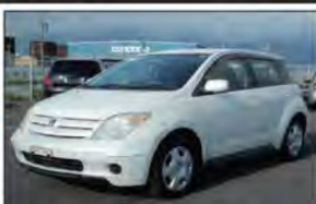
Ref.28474 PRICE: $2,740 TOYOTA IST Year 2002 AT 1,290cc PETROL Mileage 83,000km Color Pearl