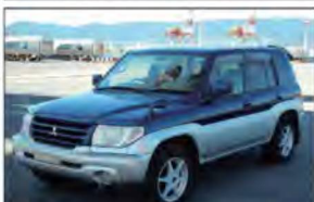
Ref.28508 PRICE: $3,730 MITSUBISHI PAJERO IO Year 2003 F 1,990cc PETROL Mileage 94,000km Color Dark Blue