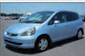
Ref.28031 PRICE: $2,330 HONDA FIT Year 2002 AT 1,330cc PETROL Mileage 90,000km Color Light Blue