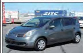
Ref.28512 PRICE: $2,660 NISSAN NOTE Year 2006 AT 1,490cc PETROL Mileage 101,000km Color Gray