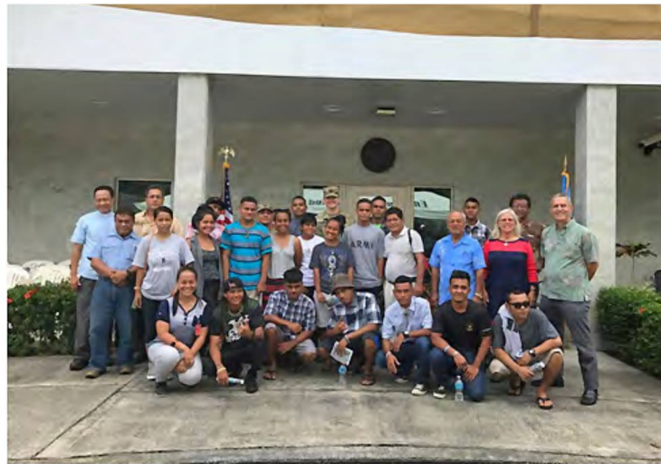
Embassy of the United States of America Kolonia