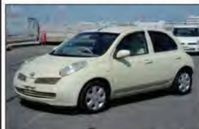
Ref.28328 PRICE: $2,260 NISSAN MARCH Year 2004 AT 1,380cc PETROL Mileage 62,000km Color Yellow