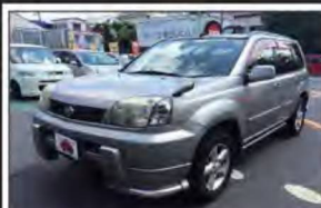
Ref.28674 PRICE: $4,150 NISSAN X-TRAIL Year 2002 AT 1,990cc PETROL Mileage 88,000km Color Silver