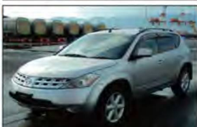
Ref.28303 PRICE: $4,830 NISSAN MURANO Year 2004 AT 2,480cc PETROL Mileage 156,000km Color Silver