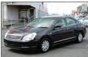
Ref.28237 PRICE: $3,490 NISSAN BLUEBIRD SYLPHY Year 2007 AT 1,990cc PETROL Mileage 87,000km Color Black