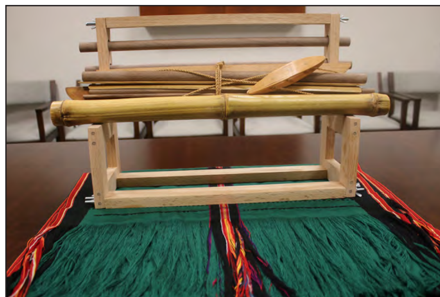
A Model loom for weaving traditional Lavalava, a traditional garment worn by Yapese Woman.