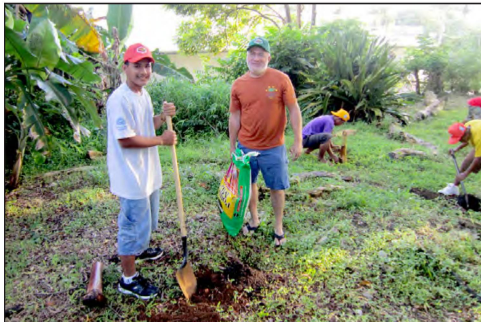
Above: Pohnpei State Legislature Below: Dekehtik causeway