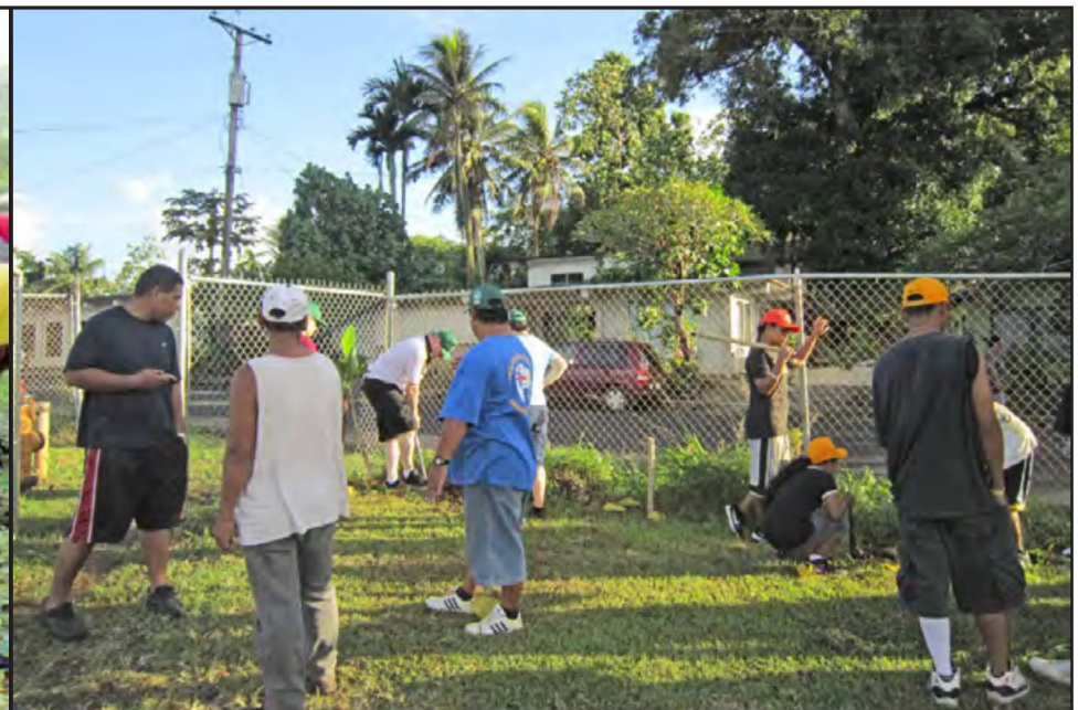
Above: Ohmine Elementary School Below: Pohnpei State Legislature