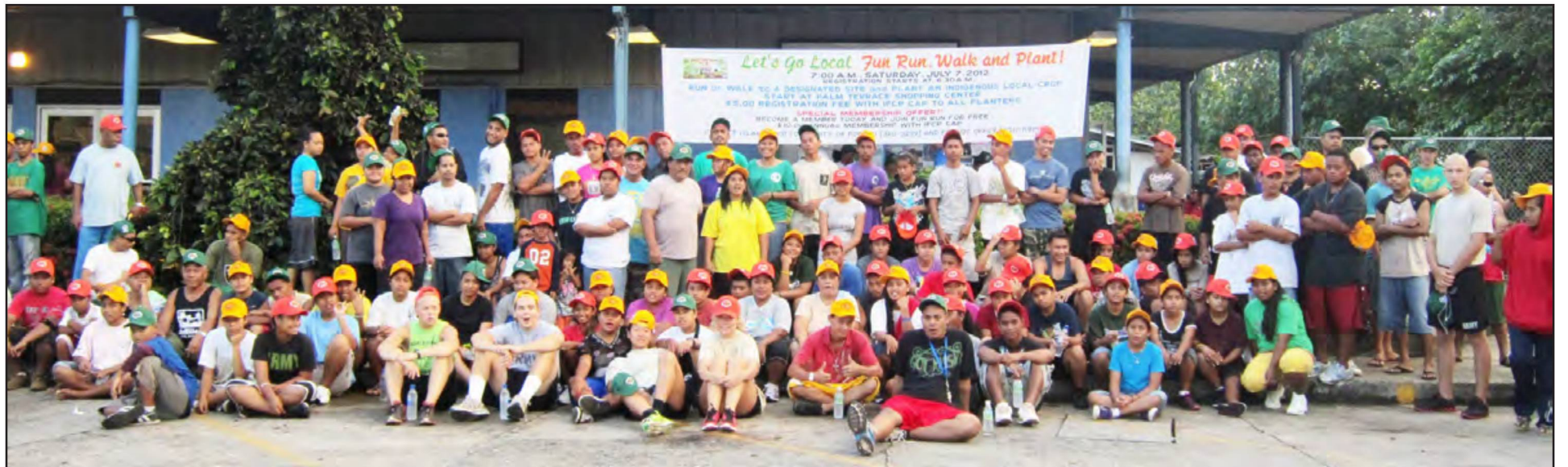
Let's Go Local Fun Run, Walk and Plant! 2012

More planting materials are available at IFCP. Please call at 320-3259.