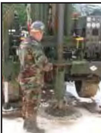
Ground is broken for the first of several wells being drilled by the Seabees