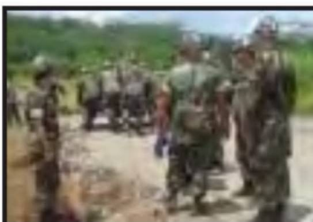
Seabees moving equipment into place in Palikir