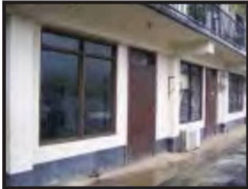
The abandoned FSM Insurance Group Office at the Black Sand Complex