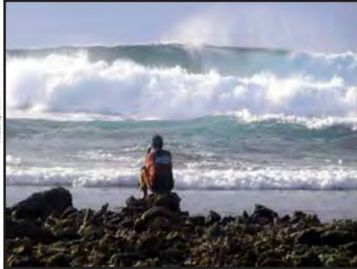
Expert sized waves breaking on the shore of Nahlap Island Resort where the free surf seminar will be held for children aged 12-18

Alloys Malfitani at 320-7845 for sign up. To book transportation and to reserve space for Nahlap Island Resort call them at 320-5009 or 320-2776.