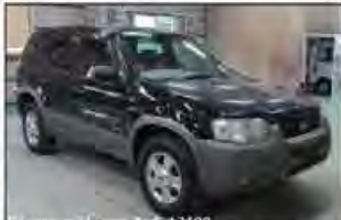
Ref. 13499 PRICE: $5,860 FORD ESCAPE Year 2001 AT 2,960cc PETROL Mileage 49,000km Color Black II