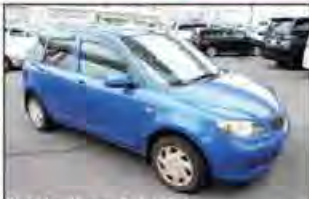
Ref. 13654 PRICE: $2,820 MAZDA DEMIO Year 2002 MT 1,340cc PETROL Mileage 45,000km Color Blue