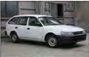
Ref. 11755 PRICE: $3,600 TOYOTA COROLLA VAN Year 2002 AT 1,300cc PETROL Mileage 95,000km Color White