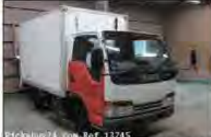
Ref. 13745 PRICE: $8,170 ISUZU ELF 1.1 ton Freezer Year 2000 MT 3,050cc DIESEL Mileage 79,000km Color White