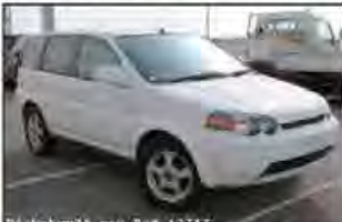
Ref. 13747 PRICE: $3,250 HONDA HR-V Year 2000 AT 1,590cc Petrol Mileage 76,000km Color White