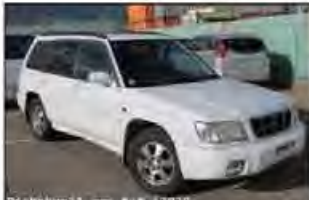
Ref. 13920 PRICE: $3,090 SUBARU FORESTER Year 2000 AT 1,990cc PETROL Mileage 56,000km Color White