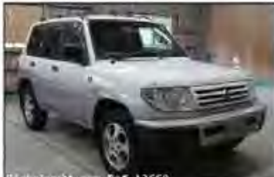
Ref. 13660 PRICE: $3,950 MITSUBISHI PAJERO IO Year 1998 AT 1,830cc PETROL Mileage 62,000km Color White II