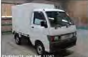
Ref. 13562 PRICE: $4,060 DAIHATSU HIJET TRUCK 0.35 ton Year 1998 MT 650cc PETROL Freezer Mileage 97,000km Color White