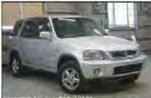
Ref. 13137 PRICE: $4,170 HONDA CR-V Year 2000 AT 1,970cc PETROL Mileage 34,000km Color Silver