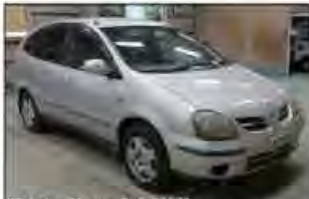
Ref. 13573 PRICE: $2,910 NISSAN TINO Year 2002 AT 1,800cc Petrol Mileage 22,000km Color Silver