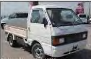
Ref. 13868 PRICE: $3,780 MAZDA BONGO TRUCK 0.85 ton Year 1996 MT 1,780cc PETROL Mileage 43,000km Color White