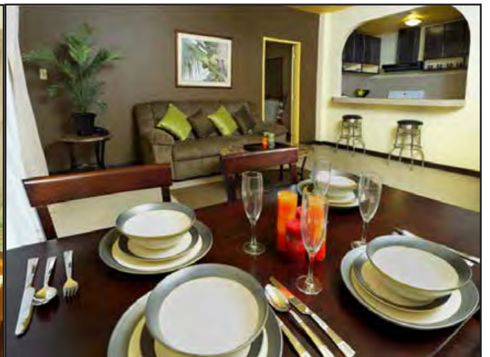
The living room of an L5 apartment