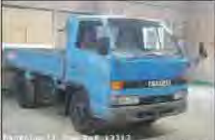
Ref. 13313 PRICE: $7,290 ISUZU ELF 2 ton High Deck Year 1993 MT 4,330cc Mileage 160,000km Color Blue

*Price Include Car Cost & Freight up to Pohnpei, Yap, Kosrae or Chuuk