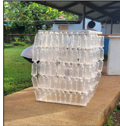
2nd place winner -Pohnpei Catholic School in Pohnpei State for creating a waste bin made of plastic bottles and wires