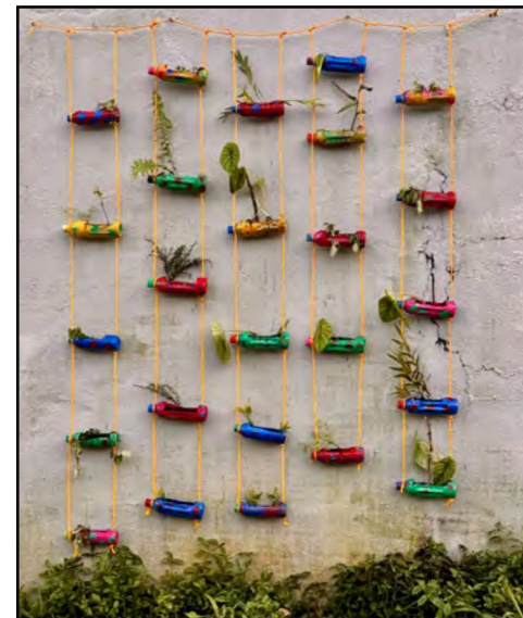
3rd place winner -Pohnpei State Seventh Day Adventist School for creating a wall hanging garden made of plastic bottles and strings

“Let's MIND Plastics and Protect our Environment” -REDUCE, REUSE, and RECYCLE