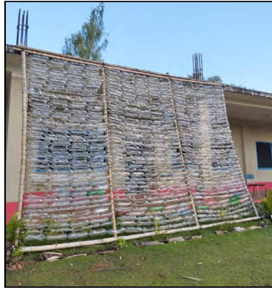
1st place winner -Yap State Seventh Day Adventist School for creating an effective Cooling System made of plastic bottles, bamboo, and plants

Additionally, we commend the winners in this year's Earth Day Contest among schools in the FSM for creating useful items from plastic materials.