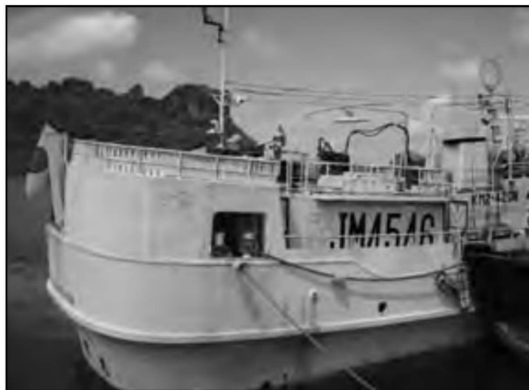
Left: The Tokuie Maru safely moored at the Pohnpei port