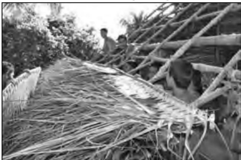
Xavier students from Pohnpei take a break from their project on the Xavier campus to smile for the camera