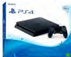
Sony PlayStation 4 Console 500GB