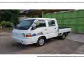
Ref.0200001920 PRICE: $5,963 HYUNDAI PORTER II Year 2003 MT 2,607cc DIESEL Mileage 68,832km Color White

*Price Include Car Cost & Freight up to Pohnpei, Yap, Kosrae or Chuuk