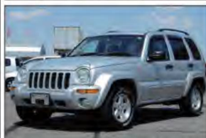
Ref.0100030631 PRICE: $5,080 CHRYSLER JEEP CHEROKEE Year 2003 AT 3,700cc PETROL Mileage 44,000km Color Silver