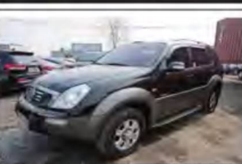
Ref.0200001776 PRICE: $3,983 SSANGYONG REXTON Year 2002 AT 2,874cc DIESEL Mileage 82,280km Color Black