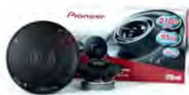
Pioneer TSG1045R 4" 210W 2-Way Car Speakers