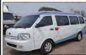
Ref.0200000993 PRICE: $7,113 KIA BONGO 3 Year 2004 MT 2,902cc DIESEL Mileage 57,465km Color White