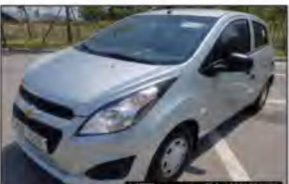
Ref.0200000907 PRICE: $4,994 GM DAEWOO SPARK Year 2015 AT 995cc DIESEL Mileage 37,834km Color Silver