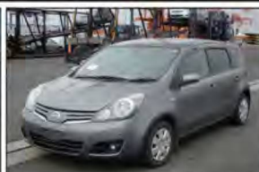
Ref.0100030305 PRICE: $2,270 NISSAN NOTE Year 2009 AT 1,490cc PETROL Mileage 111,000km Color Gray