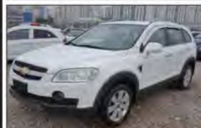
Ref.0200000848 PRICE: $6,483 GM DAEWOO WINSTORM Year 2006 AT 1,991cc DIESEL Mileage 52,124km Color White