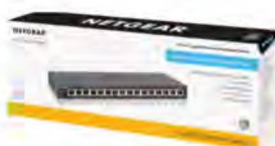
NETGEAR 16-Port Gigabit Ethernet Desktop Switch