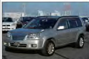
Ref.0100030202 PRICE: $4,050 NISSAN X-TRAIL AXIS Year 2005 AT 1,990cc PETROL Mileage 106,000km Color Gold