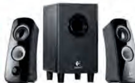
Logitech Z323 Multimedia Speakers