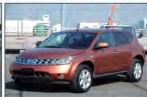
Ref.0100030051 PRICE: $5,930 NISSAN MURANO Year 2008 AT 2,480cc PETROL Mileage 101,000km Color Orange