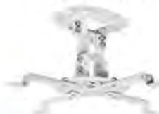
Vivo Universal Adjustable Arms Ceiling Projector Mount