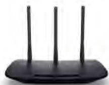
TP-Link TL V3 Wireless N450 Home Router, 450Mbps