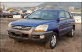
Ref.0200001316 PRICE: $4,906 KIA SPORTAGE (NEW) Year 2005 AT 1,991cc DIESEL Mileage 73,760km Color Blue