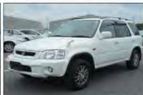
Ref.0100030617 PRICE: $3,810 HONDA CR-V Year 2000 AT 1,970cc PETROL Mileage 43,000km Color White