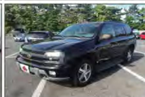
Ref.0100030730 PRICE: $3,910 CHEVROLET TRAIL BLAZER Year 2005 AT 4,150cc PETROL Mileage 77,000km Color Black