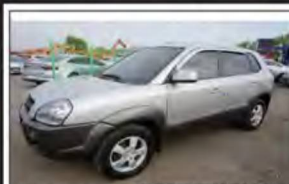
Ref.0200001791 PRICE: $4,633 HYUNDAI TUCSON Year 2004 AT 1,991cc DIESEL Mileage 74,556km Color Silver