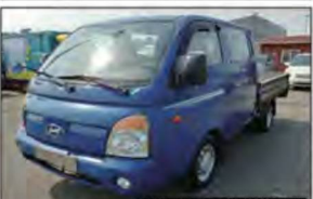
Ref.0200001921 PRICE: $5,833 HYUNDAI PORTER II Year 2009 MT 2,497cc DIESEL Mileage 32,640km Color Blue