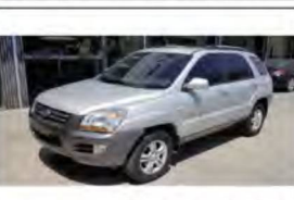
Ref.0200001363 PRICE: $5,833 KIA SPORTAGE (NEW) Year 2004 AT 2,000cc DIESEL Mileage 150,016km Color Silver