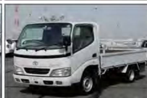
Ref.0100030388 PRICE: $5,870 TOYOTA TOYOACE Year 2005 AT 1,990cc PETROL Mileage 171,000km Color White

*Price Include Car Cost & Freight up to Pohnpei, Yap, Kosrae or Chuuk