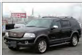
Ref.0100030319 PRICE: $4,580 FORD EXPLORER Year 2004 AT 4,000cc PETROL Mileage 60,000km Color Black