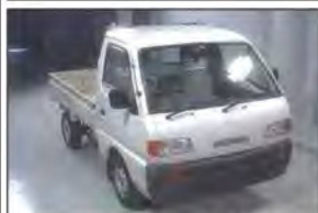
Ref.0100030760 PRICE: $2,720 SUZUKI CARRY TRUCK Year 1997 MT 660cc PETROL Mileage 26,000km Color White