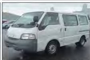
Ref.0100030684 PRICE: $3,470 MAZDA BONGO VAN Year 2003 F 1,780cc PETROL Mileage 131,000km Color White