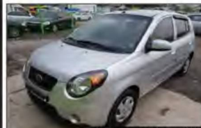
Ref.0200001969 PRICE: $3,144 KIA NEW MORNING Year 2010 MT 998cc DIESEL Mileage 56,590km Color Silver