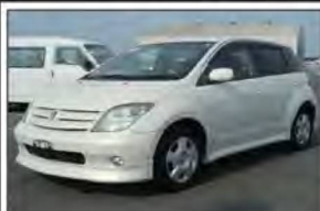
Ref.0100030516 PRICE: $2,490 TOYOTA IST Year 2005 AT 1,290cc PETROL Mileage 99,000km Color Pearl