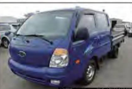
Ref.0200002089 PRICE: $5,223 KIA BONGO 3 Year 2007 AT 2,902cc DIESEL Mileage 45,665km Color Blue