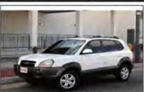
Ref.0200001980 PRICE: $6,283 HYUNDAI TUCSON Year 2006 AT 1,991cc DIESEL Mileage 25,000km Color White