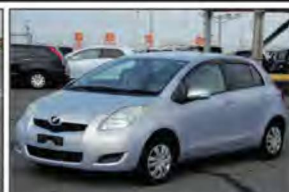
Ref.0100030653 PRICE: $2,720 TOYOTA VITZ Year 2009 AT 1,290cc PETROL Mileage 97,000km Color Purple