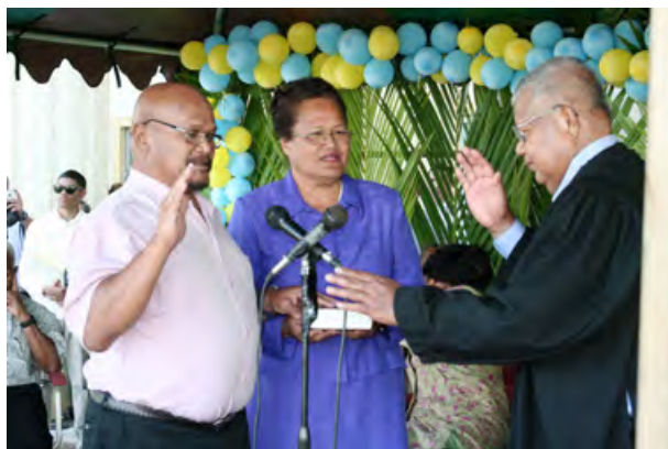
Swearing-in of Palau's Vice President