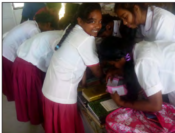
RMI students participate in a CADRE lesson

The CADRE Program is supported by AusAID, the Australian Agency for International Development. IOM staff are grateful to the school principals and classroom teachers, traditional leaders and community members whose participation and assistance are indispensable in the successful implementation of this program.