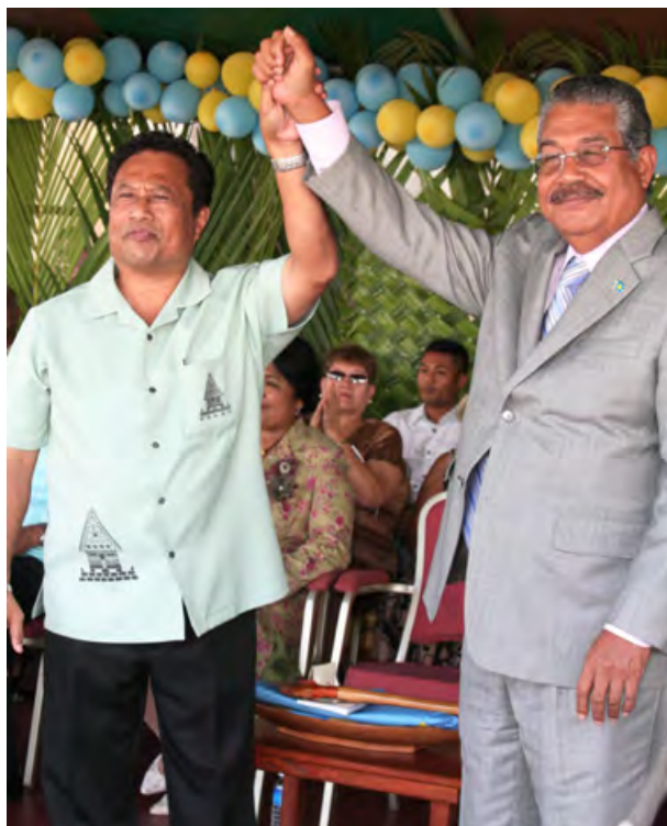
Toribiong-Remengesau uniting for Palau