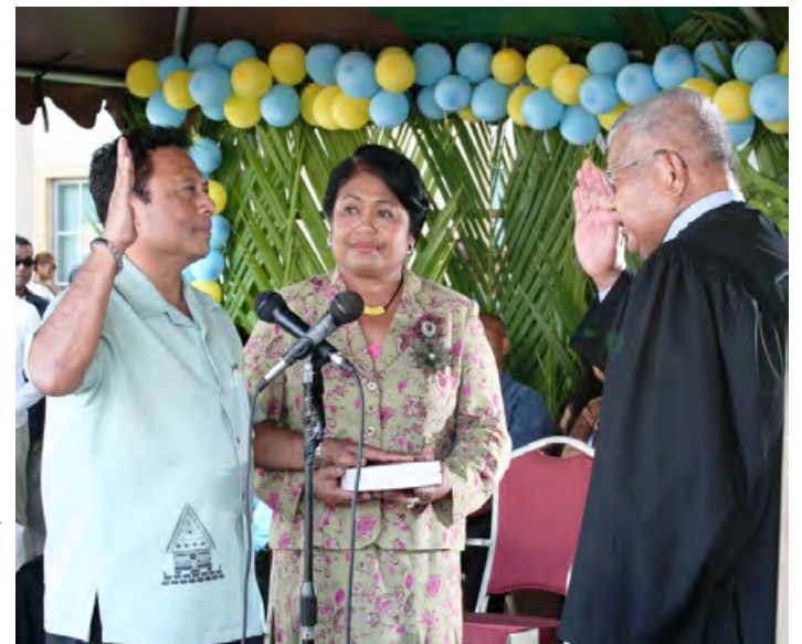
Swearing-in of Palau's President

What the President intended to be a humble ceremony turned out to be an elevated inauguration by the generous contributions of the people of Palau, friends and supporters. Remengesau thanked the leaders of the various governments for their continued support to Palau in the country's ongoing efforts to rebuild the country from the damages caused by Typhoon Bopha. Acknowledging the presence of some of these countries, Remengesau pledged to further strengthen Palau's relationship with its friends and allies around the world.