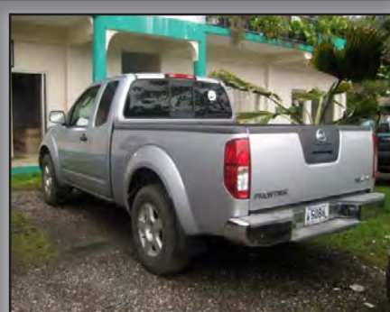
At Kosrae Branch

Make: Nissan Type: 2007 Frontier 4WD Drive: Manual Transmission Mileage: 17,509 may be different at purchase Color: Silver Minimum Bid: $10,000