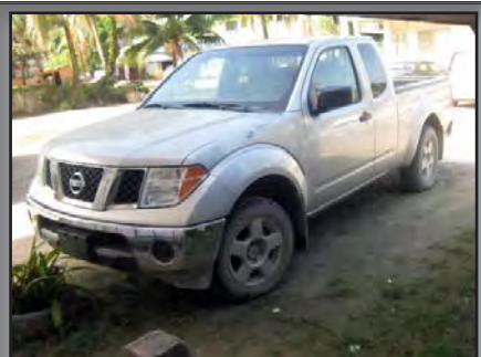
At Chuuk Branch

Opening Date: February 27, 2013 Closing Date: March 28, 2013