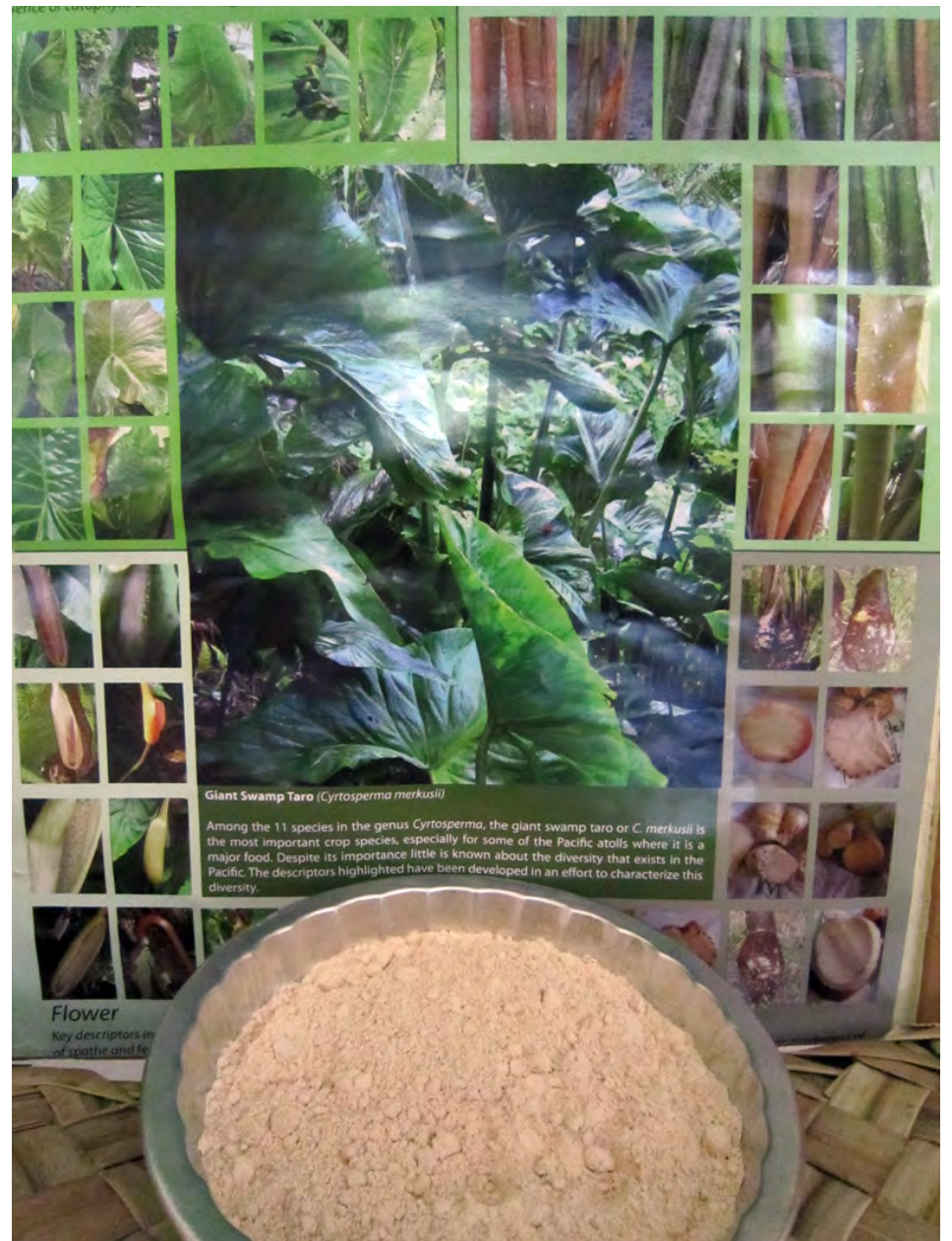
Go Local! with Giant Swamp Taro Flour

* IFCP Charcoal Ovens also assist with reducing greenhouse gases by efficiently burning coconut shell charcoal instead of electricity. These are for sale from IFCP. If you have any nutritious recipes using local foods, please email them to Island Food Community of Pohnpei to share with your community! communitydevelopment@islandfood.org