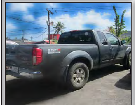
At Head Quarters

Maker: Nissan Type: 2004 Xterra Drive: Manual Transmission Mileage: 18,770 may be different at purchase Color: Silver Minimum bid: $8,000