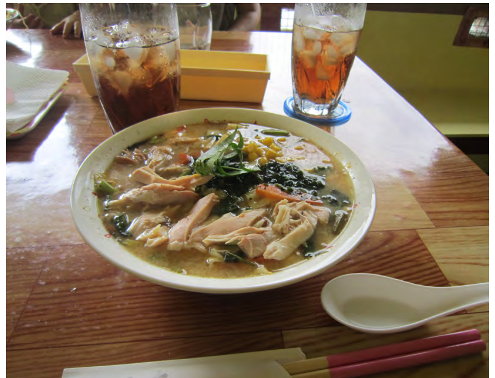
Go Local! with Homemade Healthy Miso Ramen

So instead of a pack of ramen for lunch, make a healthy choice and opt for fresh homemade Ramen with local vegetables at Nett Ramen!