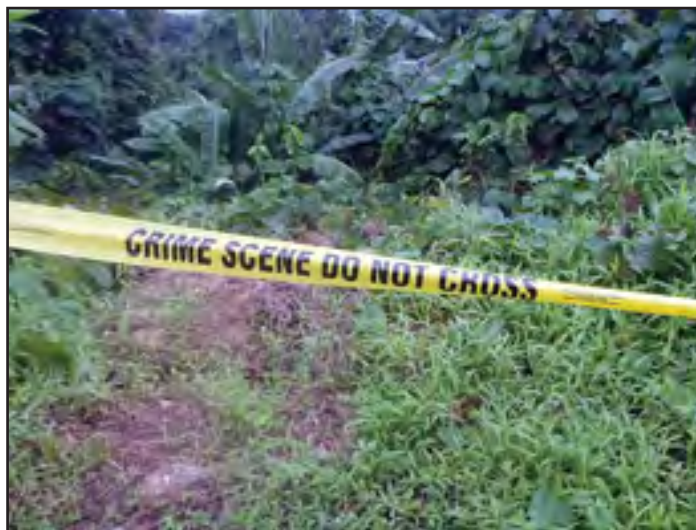
Crime Scene tape surrounds the area where Sekere woman Linda Luke’s body was found at Sokehs Ridge