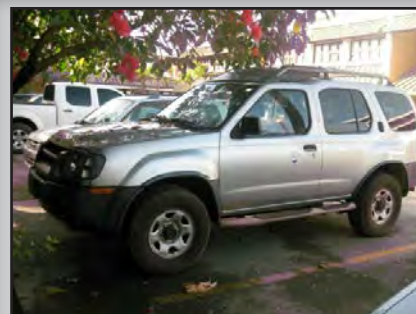
At Yap Branch

Make: Nissan Type: 2007 Frontier 4WD Drive: Manual Transmission Mileage: 19,147 may be different at purchase Color: Silver Minimum bid: $10,000