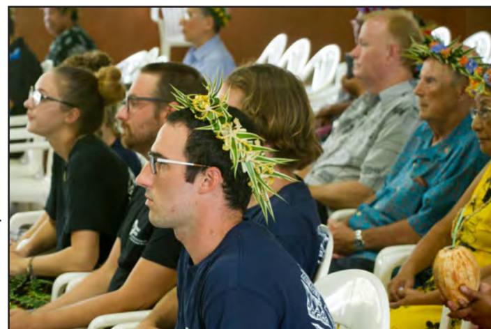
Current and previous US Peace Corps volunteers in Pohnpei