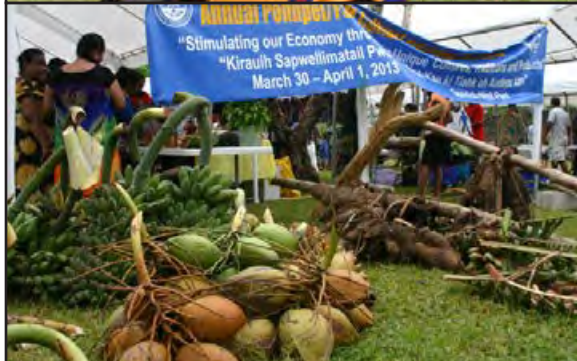
BUNDAI RANAPU "Stimulating our Economy thru "Kirauhi Sapwellimatali" March 30 - April 1, 2013