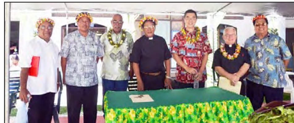
Embassy of Japan in the FSM

In a ceremony held at the St. Cecelia campus, the Government of Japan, officially handed over to the Chuuk St. Cecelia School a grant amount of $121, 870 USD. The grant will be utilized to build two new classrooms and renovate the lavatory facilities for the school. St. Cecelia is one of the oldest schools in the FSM and has yielded students who have become influential leaders in the nation of the FSM.