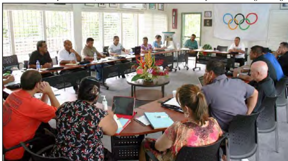
FSMNOC sports administration workshop