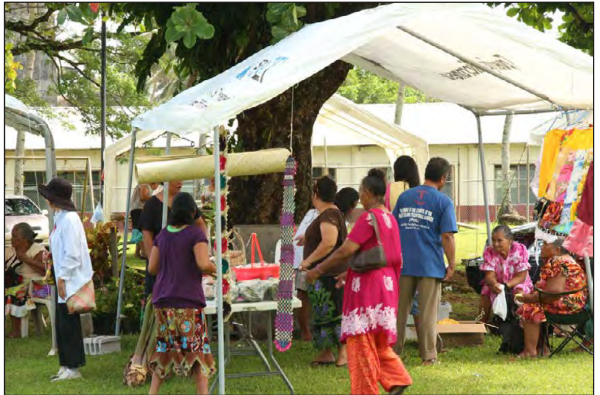
Beginning at 9:00 in the morning on Saturday, June 8, local crafters, and farmers gathered at the Spanish Wall park in Kolonia, Pohnpei to sell their wares. Pohnpei residents and tourists took advantage of the opportunity to score great deals on local products in a local setting.