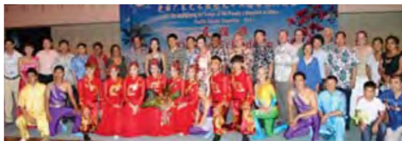
Guangdong Art Troupe with Chinese and FSM officials and diplomatic corps