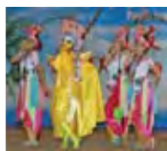
Lightning fast magical mask changing