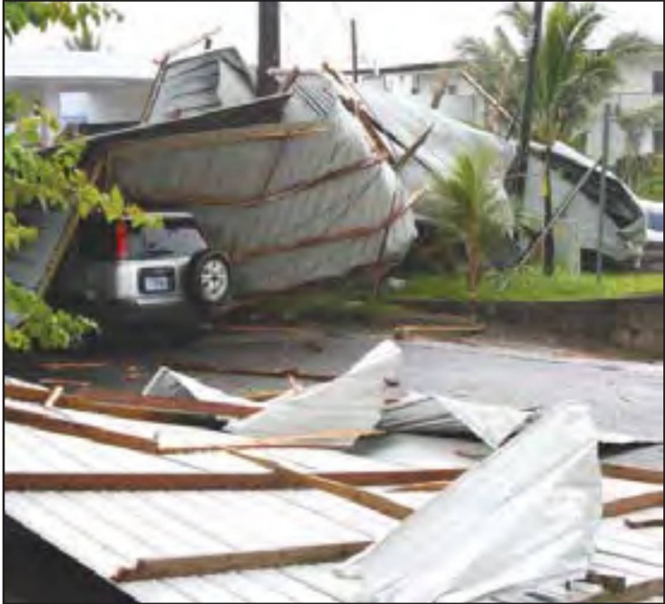
PAMI roof interrupts a Sunday afternoon drive