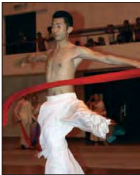
Guangdong Art Troupe member dances for the crowd

“I” stood for intimacy. “We respect each other, trust each other, consult with each other and support each other.”