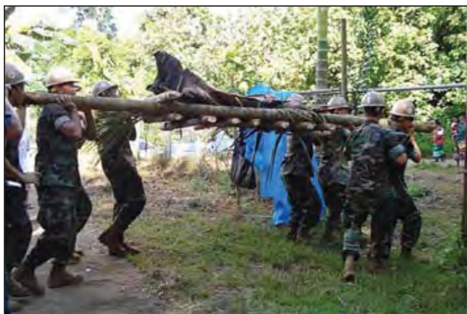
Members of Battalion 133 transport a 300lb pig, offered as a gift by His Excellency Wasa Lapalap Isopahu, Nahnmwarki of Madolenihmw, to express gratitude for the assistance under Pacific Partnership 2011.