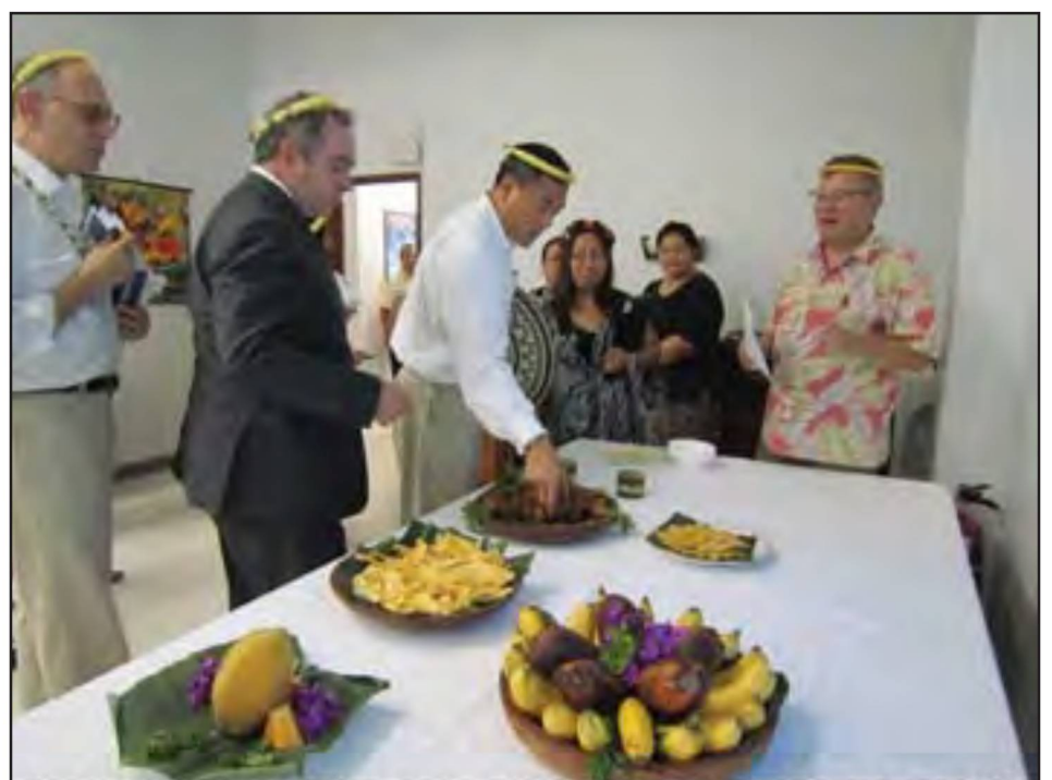
U.S. high level delegation tries the Pohnpei local snacks prepared by the Island Food Community of Pohnpei