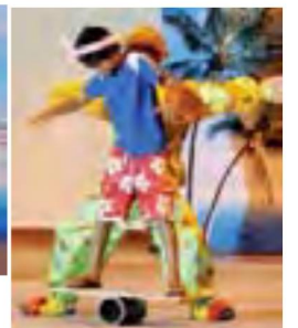
Local boy balances with just a little bit of help