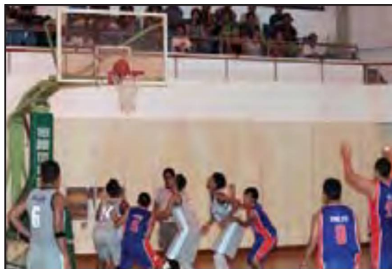
Pohnpei's aggressive hands on game combined with RMIs hard drives combined to make the free throw line one of the most visited spots on the court for RMI