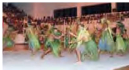
Nett group performs stick dance