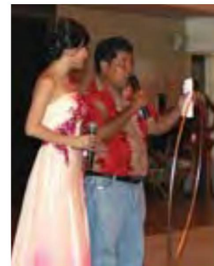
Masters of ceremonies