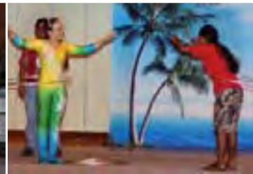
Local girl gives it a go