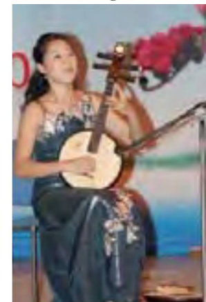
Sha Jingshan performs a virtuoso string solo