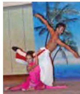
Guangdong Art Troupe dancers perform - The Soul Of Dance