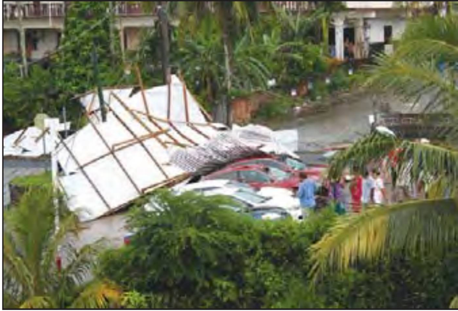
Spectators can scarcely believe what they are seeing