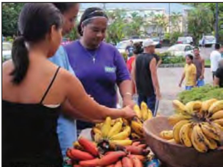
Participants grab yellow-fleshed bananas before the RUN/WALK starts