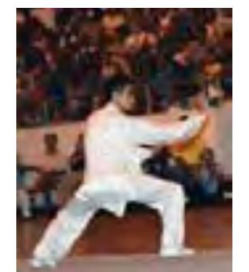
A kung fu demonstration