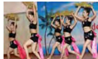
Dancers perform - The charm of Cantonese girls