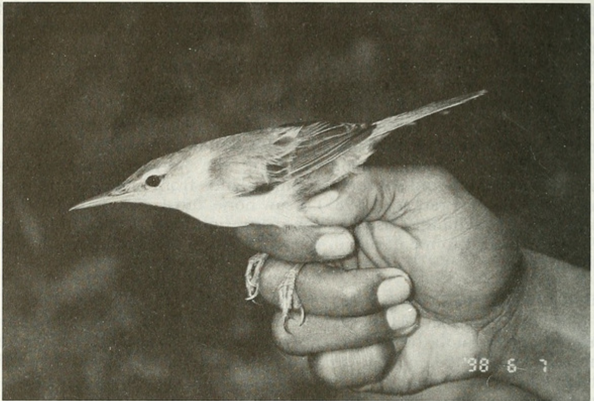
Figure B. Caroline Islands Reed Warbler Acrocephalus syrinx captured and released on Peina Island.

from the ground on many occasions, mainly along a trail leading into the forest, and was usually observed walking or hopping in tight circles, apparently feeding on insects flying close to the ground. M. cinerea breeds in Eurasia and overwinters south to southern Africa, southern Asia, Indonesia, the Philippines, New Guinea and Australia (Pizzey 1980, Pratt et al. 1987). It is a rare migrant to western Micronesia (Pratt et al. 1987), where 2–3 were observed at Koror, Palau during 12–16 October 1978 (Engbring & Owen 1981), another on Guam on 15 March 1981, and possibly two others (identified as being either M. cinerea or M. flava ) on 26 February 1981 (Maben & Wiles 1981). None of the Sapwuahfik islanders who viewed the prepared specimen was familiar with the species, indicating it is of unusual occurrence there. The Sapwuahfik record extends the range of the species about 1,600 km southeastward into Oceania.