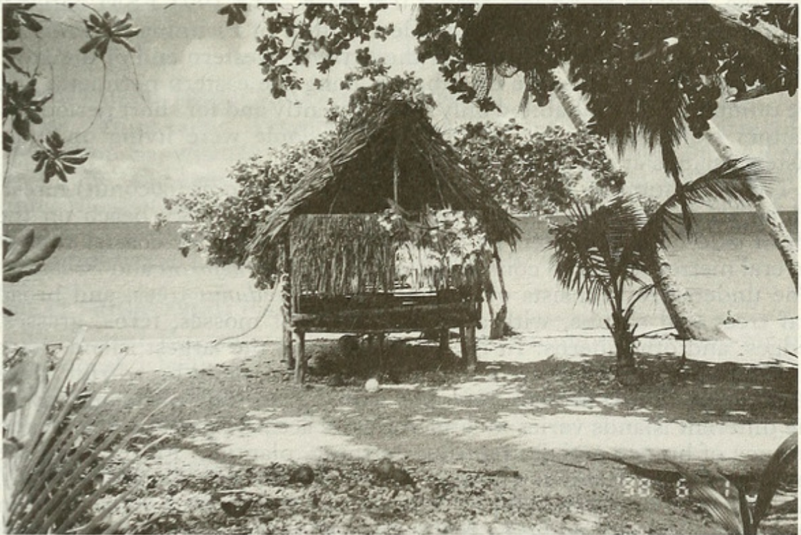
Figure A. Shelter on the lagoon-side beach of Jirup Island, Sapwuahfik Atoll.

Sapwuahfik Atoll is a part of the Federated States of Micronesia, which includes the main islands of Yap, Chuuk [formerly Truk], Pohnpei, and Kosrae, and their many outliers. The name Ngatik was used for the atoll prior to 1985, and is still used for the largest and only permanently settled island. The atoll is about 160 km southeast of Pohnpei, the nearest island and the administrative seat. It is about 21.0 km long and up to 9.5 km wide (Fig. 1). Its ten, low, coralline islands have a total land area of about 1.6 km 2 . A deep water channel on the southern side provides the only passage for boats into and