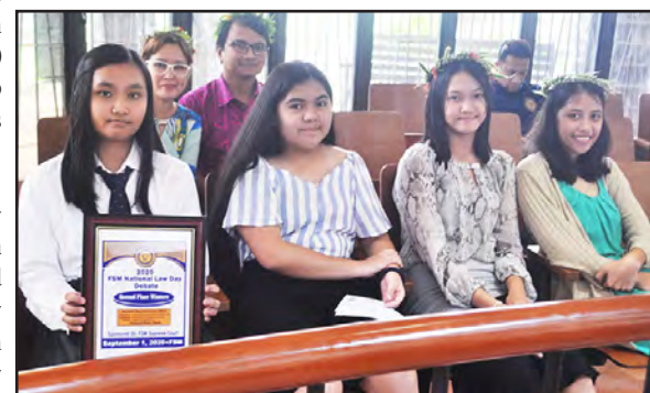
Second Place Winners