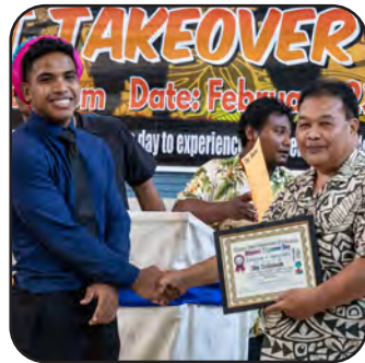
Ike Solomon-OLMCHS-Pohnpei State Governor