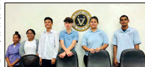
First Place Winners

Regardless of the status of the world pandemic, the Court is prepared to host debate teams from all across the FSM on July 12, 2021. Congratulations to the 2020 debate teams, and for 2021, may the best team win!