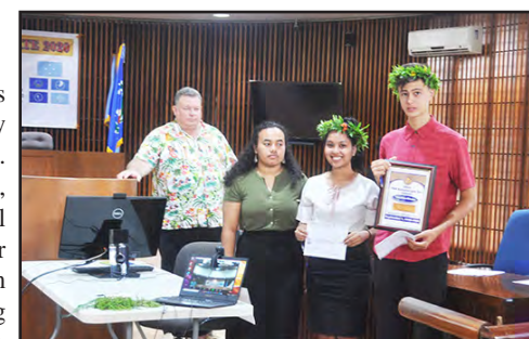
Third Place Winners