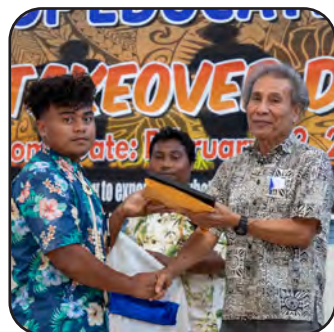
K'conAndon-NMHS-Pohnpei State Lt. Governor