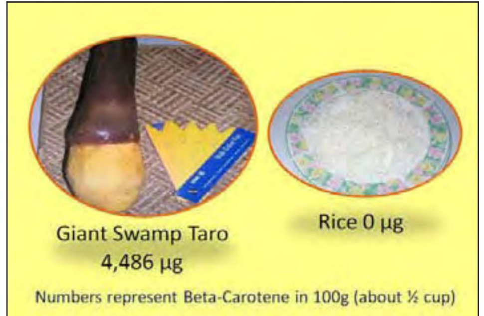
Contents of beta carotene in 100g (about ½ cup) of giant swamp taro and rice

Giant swamp taro (mwahng), which has been incorrectly believed as “just starch,” has turned out to be one of Pohnpeian rich nutrition treasures. The high nutritional values of taro are the secret of a strong body of ancient Pohnpeians.