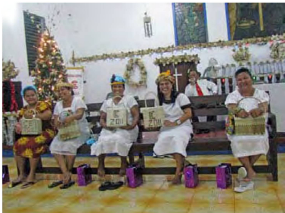
Kepinle church is decorated with local handmade Christmas ornaments.

Consumption of foods rich in provitamin A carotenoids, including beta-carotene, helps protect against vitamin A deficiency disorders and anemia. These and other carotenoids helps protect against chronic diseases, including cancer, heart disease, and diabetes. All Cyrtosperma cultivars (and other taro types) are superior to rice in respect to carotenoid content, as all types of taro contain at least some beta-carotene, whereas rice contains none.