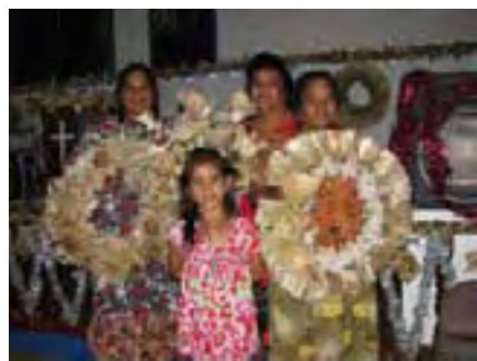
Local Christmas wreath with makers