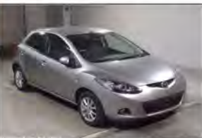
Ref.26905 PRICE: $3,660 MAZDA DEMIO Year 2010 AT 1,340cc PETROL Mileage 89,000km Color Gray