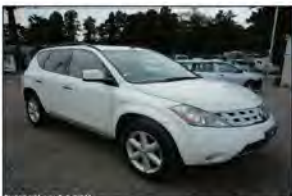
Ref.25744 PRICE: $5,710 NISSAN MURANO Year 2006 AT 2,480cc PETROL Mileage 162,000km Color Pearl