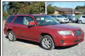
Ref.26081 PRICE: $4,240 SUBARU FORESTER Year 2006 AT 1,990cc PETROL Mileage 130,000km Color Wine Red