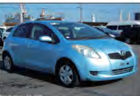
Ref.26677 PRICE: $2,790 TOYOTA VITZ Year 2005 AT 990cc PETROL Mileage 70,000km Color Light Blue