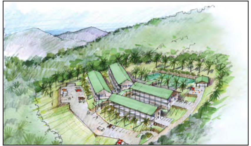
Artist’s rendition of proposed campus at Nantaku Site.

Student success remains at the center of the college’s efforts to achieve its mission to be a “learner-centered institution of higher education that is committed to the success of the Federated States of Micronesia by providing academic and career & technical educational programs characterized by continuous improvement and best practices”.