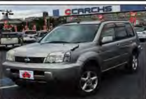
Ref.26968 PRICE: $4,200 NISSAN X-TRAIL Year 2002 AT 2,000cc PETROL Mileage 77,000km Color Silver