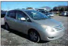
Ref.26757 PRICE: $3,090 TOYOTA COROLLA SPACIO Year 2004 AT 1,500cc PETROL Mileage 60,000km Color Silver