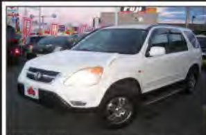
Ref.26901 PRICE: $4,800 HONDA CR-V Year 2002 AT 1,998cc PETROL Mileage 92,000km Color Pearl