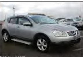
Ref.26843 PRICE: $5,980 NISSAN DUALIS Year 2007 AT 1,990cc PETROL Mileage 150,000km Color Silver

*Price Include Car Cost & Freight up to Pohnpei, Yap, Kosrae or Chuuk