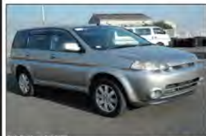
Ref.26466 PRICE: $3,100 HONDA HR-V Year 2003 AT 1,590cc PETROL Mileage 96,000km Color Silver