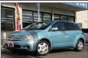
Ref.26902 PRICE: $3,200 TOYOTA IST Year 2004 AT 1,300cc PETROL Mileage 68,000km Color Blue