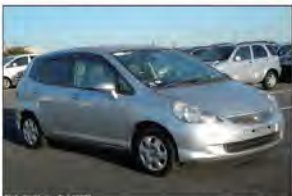
Ref.26893 PRICE: $2,620 HONDA FIT Year 2007 AT 1,330cc PETROL Mileage 122,000km Color Silver