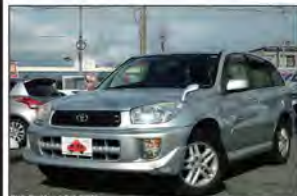
Ref.26935 PRICE: $4,860 TOYOTA RAV4 Year 2002 AT 1,990cc PETROL Mileage 170,000km Color Silver