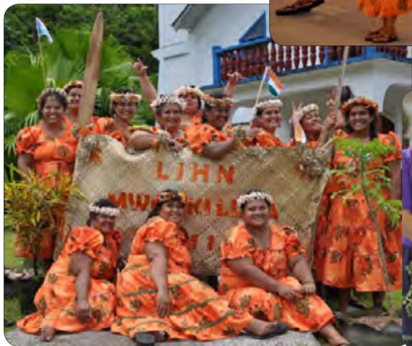
A small part of the Lihn Mwoakilloa ladies group poses for the camera