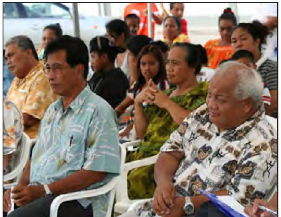
FSM President Manny Mori and former President John Haglelgam