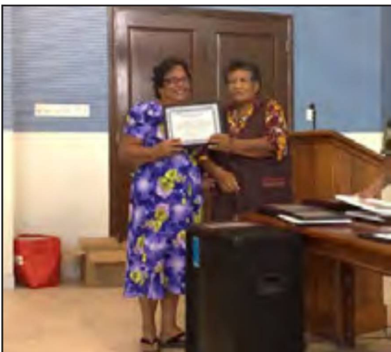
First Place - Lielehle