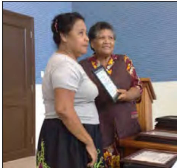
Second Place - EMPWA