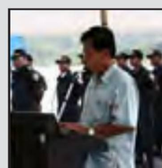
See page 2

F inal salute for Yap Police Chief Buchun