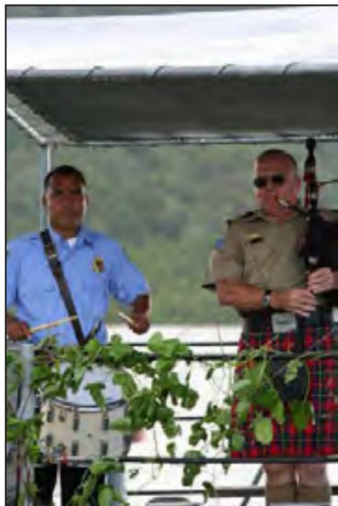
Pipes and Drum