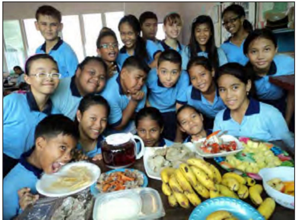
CCA 6th graders happily go for yummy local food