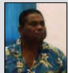
See page 3

F inal salute for Yap Police Chief Buchun