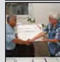
See page 5