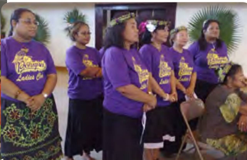
The Pohnpei Ladies Club tied for second place in the entertainment category