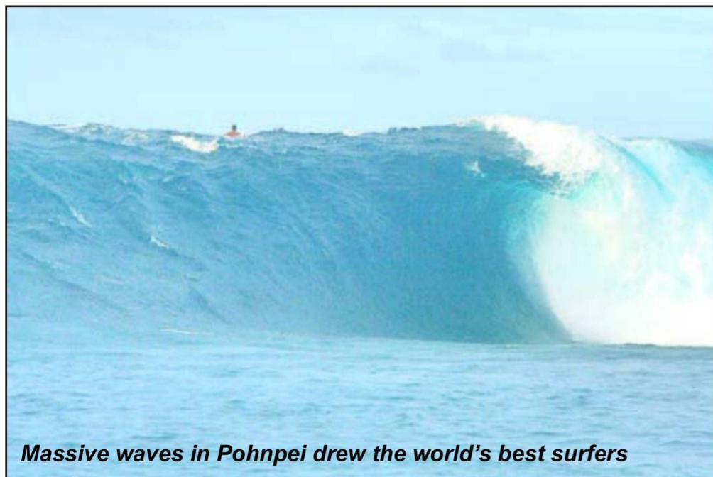
Massive waves in Pohnpei drew the world's best surfers

But while Irons has achieved greatness, Slater has attained God-like status, not just among surfers but throughout the entire sporting world as well. "The planet's greatest surfer deserves to be mentioned in the same breath as Michael Schumacher, Lance Armstrong and Tiger Woods," exclaimed a recent article in The Guardian. "The Floridian surfer's latest triumph (the 2008 World Championship) consolidates an already unparalleled career in professional surfing, one which demon-