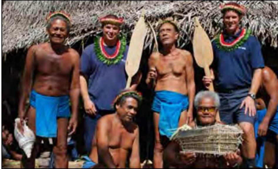
Woleai Chiefs with the Coast Guard Cutter Assateague Commanding and Executive Officers

Cutter Assateague is a 110 foot Island-Class patrol boat based in Apra Harbor, Guam. The cutter supports many Coast Guard missions, including search and rescue, port security, and maritime law enforcement.