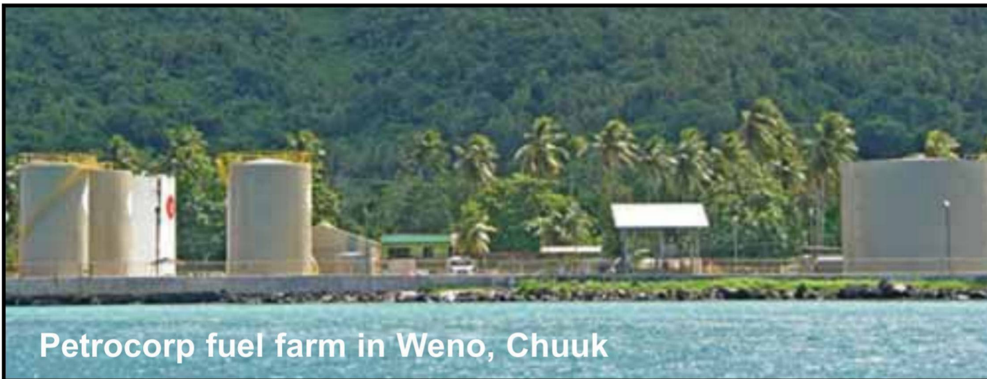
Petrocorp fuel farm in Weno, Chuuk