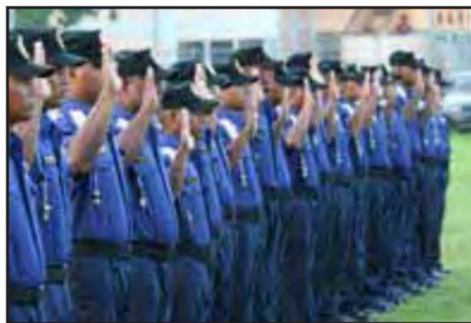
New recruits sworn in at Pohnpei Police Academy Graduation ceremony