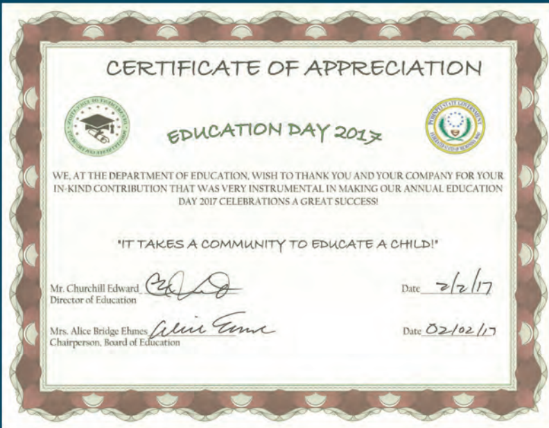
Sponsoring Pohnpei Education Day.