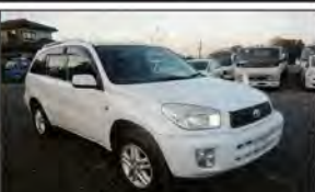
Ref.26206 PRICE: $5,110 TOYOTA RAV4 Year 2002 AT 1,990cc PETROL Mileage 137,000km Color Pearl