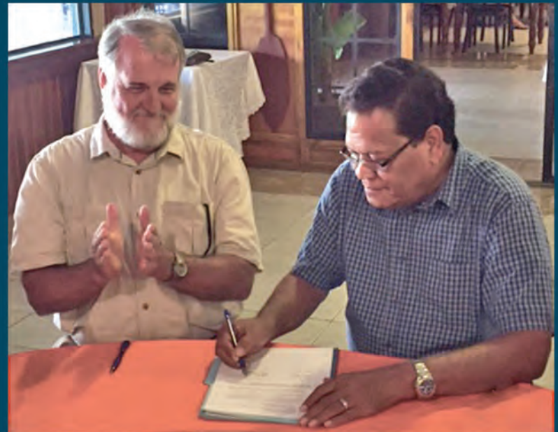
Boosting the Rotary Scholarship Fund.

Our human resource is our most valuable resource.