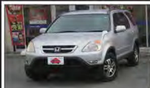
Ref.26722 PRICE: $4,430 HONDA CR-V Year 2001 AT 1,990cc PETROL Mileage 65,000km Color Silver