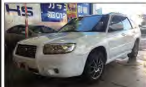
Ref.26801 PRICE: $4,490 SUBARU FORESTER Year 2006 AT 1,990cc PETROL Mileage 107,000km Color White