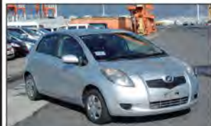
Ref.26619 PRICE: $2,545 TOYOTA VITZ Year 2006 AT 1,290cc PETROL Mileage 138,000km Color Silver