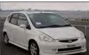
Ref.26733 PRICE: $2,435 HONDA FIT Year 2002 AT 1,330cc PETROL Mileage 106,000km Color Pearl

*Price Include Car Cost & Freight up to Pohnpei, Yap, Kosrae or Chuuk