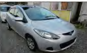
Ref.26390 PRICE: $3,305 MAZDA DEMIO Year 2007 AT 1,340cc PETROL Mileage 84,000km Color Silver