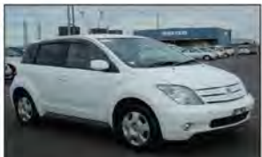
Ref.26175 PRICE: $2,880 TOYOTA IST Year 2004 AT 1,290cc PETROL Mileage 86,000km Color White