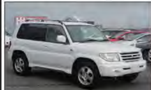
Ref.26557 PRICE: $3,680 MITSUBISHI PAJERO IO Year 2002 AT 1,990cc PETROL Mileage 82,000km Color Pearl