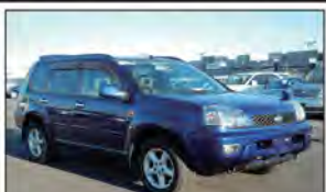
Ref.26851 PRICE: $4,250 NISSAN X-TRAIL Year 2002 AT 1,990cc PETROL Mileage 101,000km Color Dark Blue