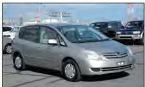
Ref.26888 PRICE: $3,170 TOYOTA COROLLA SPACIO Year 2004 AT 1,490cc PETROL Mileage 113,000km Color Gold