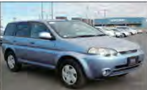
Ref.26487 PRICE: $2,910 HONDA HR-V Year 2001 AT 1,590cc PETROL Mileage 134,000km Color Light Blue