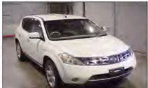
Ref.26872 PRICE: $5,950 NISSAN MURANO Year 2004 AT 3,500cc PETROL Mileage 138,000km Color Pearl