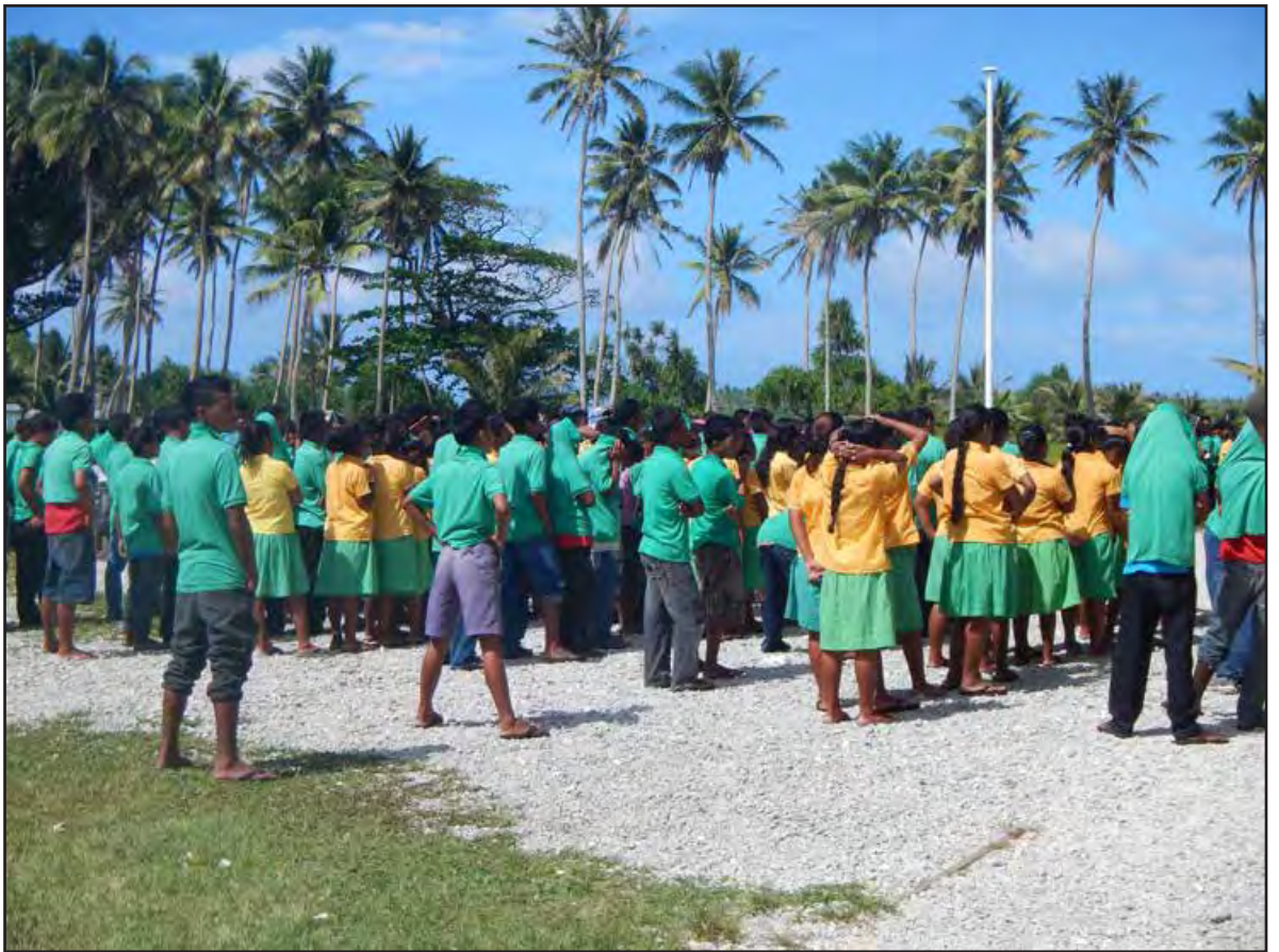
School emergency evacuation drill

In partnership with Women United Together Marshall Islands (WUTMI), the team held two sessions to conduct hazard, vulnerability, capacity, and mapping exercises with the JHS school staff and faculty, student body government, and Jabor community members. These sessions entailed drawing maps of the school campus and surrounding areas, highlighting vulnerable areas as