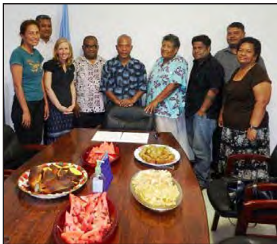
IFCP signing grant agreement at UNDP office

The Small Grants Programme, FSM is part of a global GEF funding modality initiative implemented by UNDP on behalf of GEF partnership to provide grants to FSM NGOs and community-based initiatives that works to mitigate threats to the environment, support sustainable community livelihood development and to build capacity of its grantees to be more effective. The Programme is hosted by the UN Joint Presence Initiative office in country on Kaselehlie Street in Pohnpei.