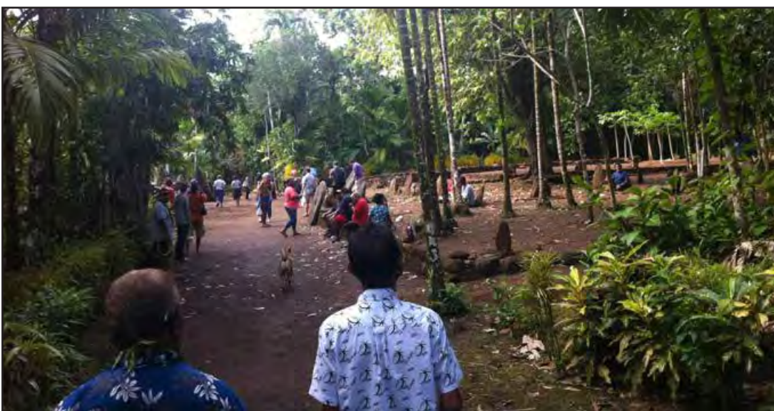
Workshop participants visit the Mangyol Stone Money Bank in Makiy Village, Gagil Municipality, Yap. The Mangyol site and the Republic of Palau's Rock Island quarry sites are being considered for a UNESCO World Heritage Site nomination

With the support of UNESCO (United Nations Educational, Scientific and Cultural Organization), the Australian Government Funds in Trust Program, the Japanese Government Funds in Trust Program, the Pacific Heritage Hub at USP (University of the South Pacific), WHITRAP (World Heritage Institute of Training and Research for the Asia and the Pacific Region), ICOMOS Pasifika, the U.S. National Park Service and others, the "Workshop on the Development of the Management Plans of Heritage Sites in the Micronesian region" provided for the travel and accommodation costs of professional technical experts to assist those from the region involved with World Heritage Site nominations. The workshop