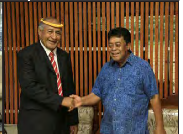
Vice President Alik and President Nailatikau