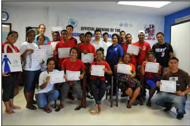
The International Organization for Migration

Pohnpei – The word is out and people from outside the Federation are now visiting Micronesia’s first Migrant Resource Center (MRC) in Pohnpei. On April 11 around 20 students from the Seventh Day Adventist High School, and their teachers, dropped into the MRC.