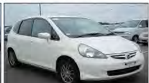
Ref.27402 PRICE: $2,620 HONDA FIT Year 2007 AT 1,330cc PETROL Mileage 96,000km Color White