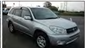
Ref.27408 PRICE: $5,460 TOYOTA RAV4 Year 2004 AT 1,990cc PETROL Mileage 119,000km Color Silver