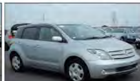
Ref.27405 PRICE: $2,970 TOYOTA IST Year 2003 AT 1,490cc PETROL Mileage 28,000km Color Silver