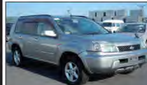
Ref.26968 PRICE: $3,800 NISSAN X-TRAIL Year 2002 AT 1,990cc PETROL Mileage 79,000km Color Silver