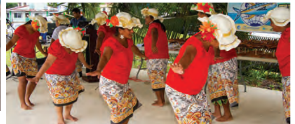
Lien Mwoakilloa perform their award winning dance