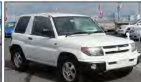
Ref.26987 PRICE: $2,810 MITSUBISHI PAJERO IO Year 2000 AT 1,830cc PETROL Mileage 85,000km Color White