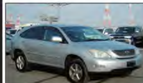
Ref.26601 PRICE: $6,610 TOYOTA HARRIER Year 2003 AT 2,360cc PETROL Mileage 153,000km Color Silver