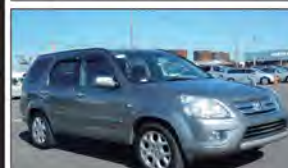
Ref.26767 PRICE: $5,290 HONDA CR-V Year 2004 AT 2,350cc PETROL Mileage 74,000km Color Gunmetal