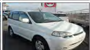
Ref.27111 PRICE: $3,450 HONDA HR-V Year 2004 AT 1,590cc PETROL Mileage 79,000km Color Pearl