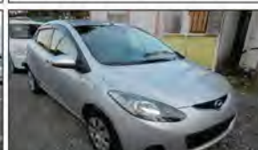
Ref.26390 PRICE: $3,010 MAZDA DEMIO Year 2007 AT 1,340cc PETROL Mileage 84,000km Color Silver