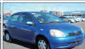
Ref.26616 PRICE: $2,290 TOYOTA VITZ Year 2001 AT 990cc PETROL Mileage 84,000km Color Blue