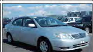
Ref.26969 PRICE: $3,920 TOYOTA COROLLA Year 2004 AT 1,490cc PETROL Mileage 70,000km Color Silver

*Price Include Car Cost & Freight up to Pohnpei, Yap, Kosrae or Chuuk