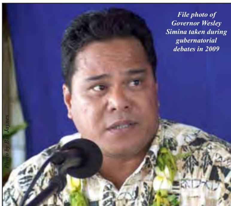
File photo of Governor Wesley Simina taken during gubernatorial debates in 2009

Part of the question of Chuuk’s civil action against the FSM seems to revolve around who the duly elected “representative” of Tolensom is. Is it Amanto Marsolo, as Chuuk State believes, or Kisauo Esa as the FSM National Government believes? Both Marsolo and Esa have called themselves the Mayor of Tolensom, Faichuuk.