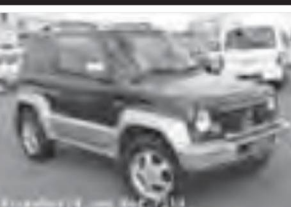
Ref. 7219 PRICE: $2,590 MITSUBISHI PAJERO JR. 4WD Year 1998 MT 1,100cc PETROL