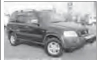
Ref. 7258 PRICE: $3,790 HONDA CR-V 4WD Year 1997 MT 2,000cc PETROL