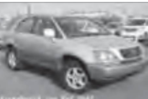
Ref. 6987 PRICE: $5,090 TOYOTA HARRIER Year 1998 AT 2,200cc PETROL

Over 1,000 vehicles available on our website!!