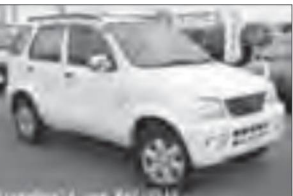
Ref. 7315 PRICE: $3,890 TOYOTA CAMI Year 2000 MT 1,300cc PETROL