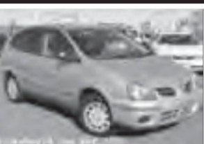
Ref. 7237 PRICE: $1,650 NISSAN TINO Year 2002 AT 1,800cc PETROL