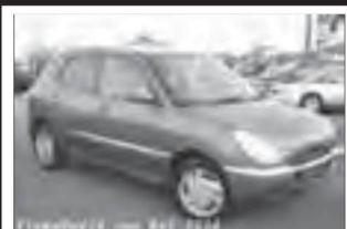
Ref. 7224 PRICE: $1,250 DAIHATSU STORIA Year 1998 AT 1,000cc PETROL