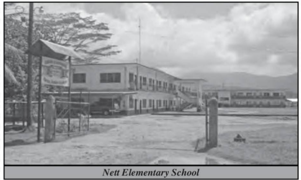
Nett Elementary School

Clayton Santos is the Laboratory Supervisor for Pohnpei EPA who is one of the two employees responsible for water supply testing. He said that it’s not unusual to have completely different total coliform readings on different days. During times of rainfall there is more groundwater that surrounds the pipes. Some days there is more demand for water up and down the pipeline which can allow more contaminants to enter the pipes