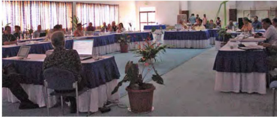
Delegates at the Micronesian Chief Executives' Summit meet at College of Micronesia National Campus

Palikir, Pohnpei - This week, Pohnpei State and the FSM National Government played host to the 10 th Micronesian Chief Executives' Summit or MCES held at the FSM-China Friendship Gymnasium at the COM-FSM National Campus. Delegates from Guam, CNMI, Palau, the Marshall Islands, and all four of the Federated States of Micronesia, plus participants from the FSM National Government, met in committees for two days to prepare presentations and recommendations to the nine Principals involved in this year's Plenary Session of the Summit held on Thursday, November 20 th .