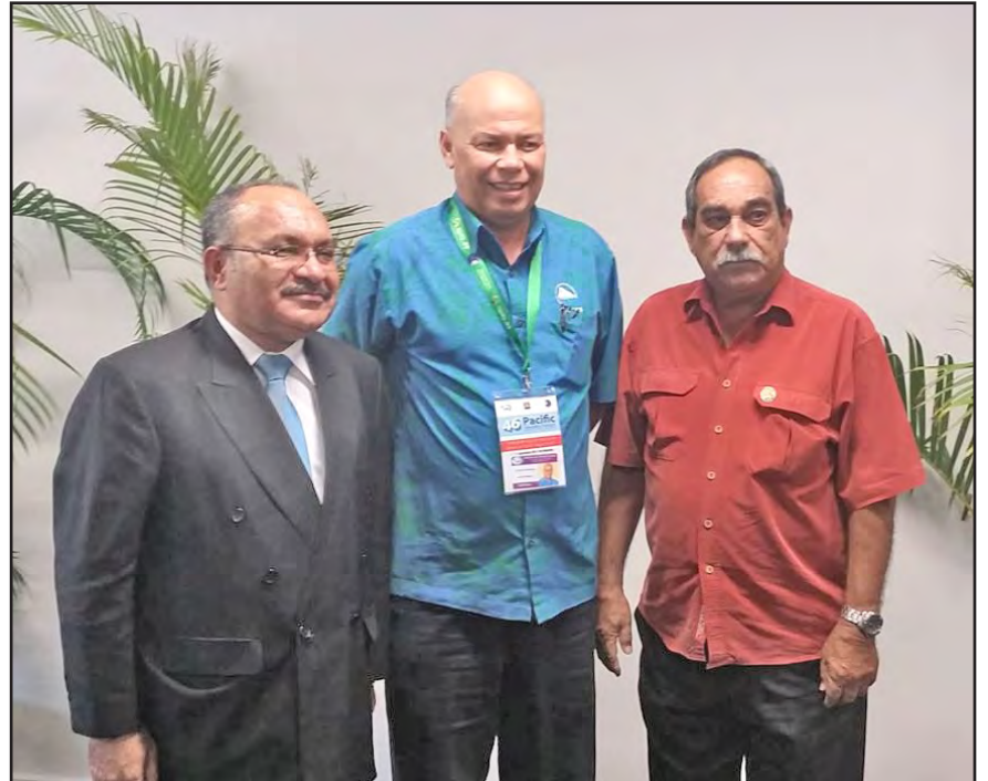
Prime Minister Peter O'Neil, SPC Director-General Dr. Colin Tukuitonga, President Peter M. Christian

With the advancements of technology and mapping systems, FSM and PNG have been working together in the last few years to improve the coordinates used through a series of technical and legal meetings supported by the SPC-Geoscience Division and the Attorney Generals' Department of Australia and Forum Fisheries