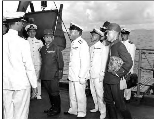
Japanese delegation on USS Portland to surrender Truk, 1945