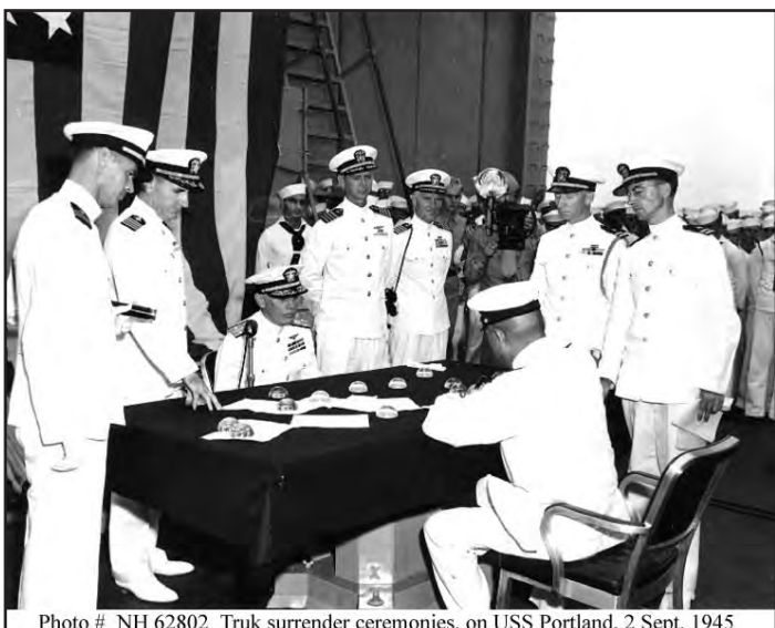
Photo # NH 62802 Truk surrender ceremonies, on USS Portland, 2 Sept. 1945

On 2 September, we will say a prayer and commemorate 70 Years of Peace in the Pacific.