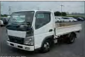
Ref.28722 PRICE: $5,740 MITSUBISHI CANTER GUTS Year 2006 MT 1,990cc PETROL Mileage 182,000km Color White

*Price Include Car Cost & Freight up to Pohnpei, Yap, Kosrae or Chuuk