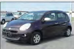
Ref.28585 PRICE: $2,910 TOYOTA PASSO Year 2010 AT 990cc PETROL Mileage 124,000km Color Purple