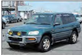
Ref.28631 PRICE: $4,410 TOYOTA RAV4 Year 1995 F 1,990cc PETROL Mileage 131,000km Color Green