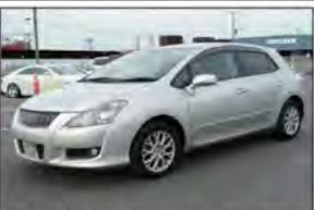
Ref.28625 PRICE: $3,750 TOYOTA BLADE Year 2007 AT 2,360cc PETROL Mileage 143,000km Color Silver