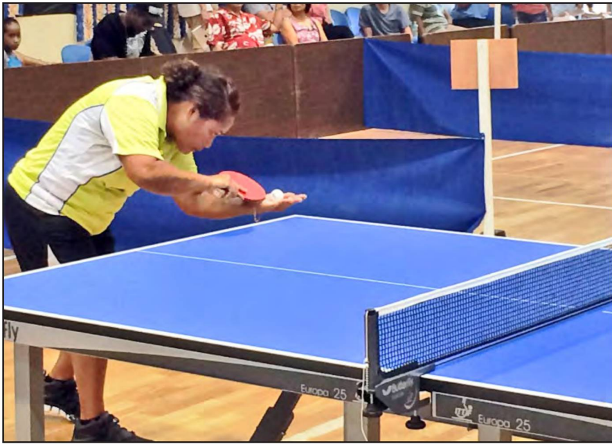
2014 MicroGames Table Tennis Competition

The 2018 MicroGames is a quadrennial event that will take place in Yap July 15 – 27, 2018. Teams from FSM, Guam, Nauru, Palau, Kiribati, the Marshall Islands and the Northern Mariana Islands will compete in Baseball, Basketball, Beach Volleyball, Va'a Canoe, Soccer, Spearfishing, Table Tennis, Track & Field, Volleyball, Weightlifting, Wrestling, Open Water Swimming and the Micronesian All-Around. For more information: www.microgames2018.com .