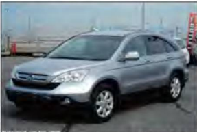
Ref.28608 PRICE: $6,440 HONDA CR-V Year 2007 AT 2,350cc PETROL Mileage 169,000km Color Gray