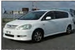
Ref.28582 PRICE: $3,320 TOYOTA IPSUM Year 2002 AT 2,360cc PETROL Mileage 83,000km Color White