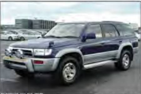
Ref.28640 PRICE: $5,110 TOYOTA HILUX SURF Year 1998 AT 3,370cc PETROL Mileage 155,000km Color Dark Blue