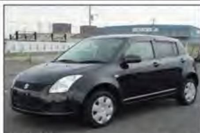
Ref.28666 PRICE: $2,730 SUZUKI SWIFT Year 2007 AT 1,320cc PETROL Mileage 137,000km Color Black