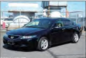
Ref.28607 PRICE: $3,380 HONDA ACCORD Year 2003 AT 2,350cc PETROL Mileage 142,000km Color Black