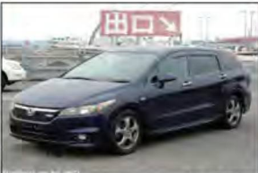
Ref.28675 PRICE: $3,130 HONDA STREAM Year 2007 AT 1,990cc PETROL Mileage 175,000km Color Dark Blue