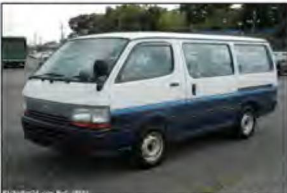
Ref.28581 PRICE: $5,520 TOYOTA HIACE VAN Year 1995 AT 1,990cc PETROL Mileage 147,000km Color White