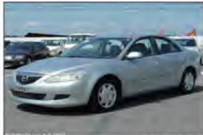
Ref.28617 PRICE: $2,780 MAZDA ATENZA SEDAN Year 2002 AT 2,360cc PETROL Mileage 139,000km Color Silver