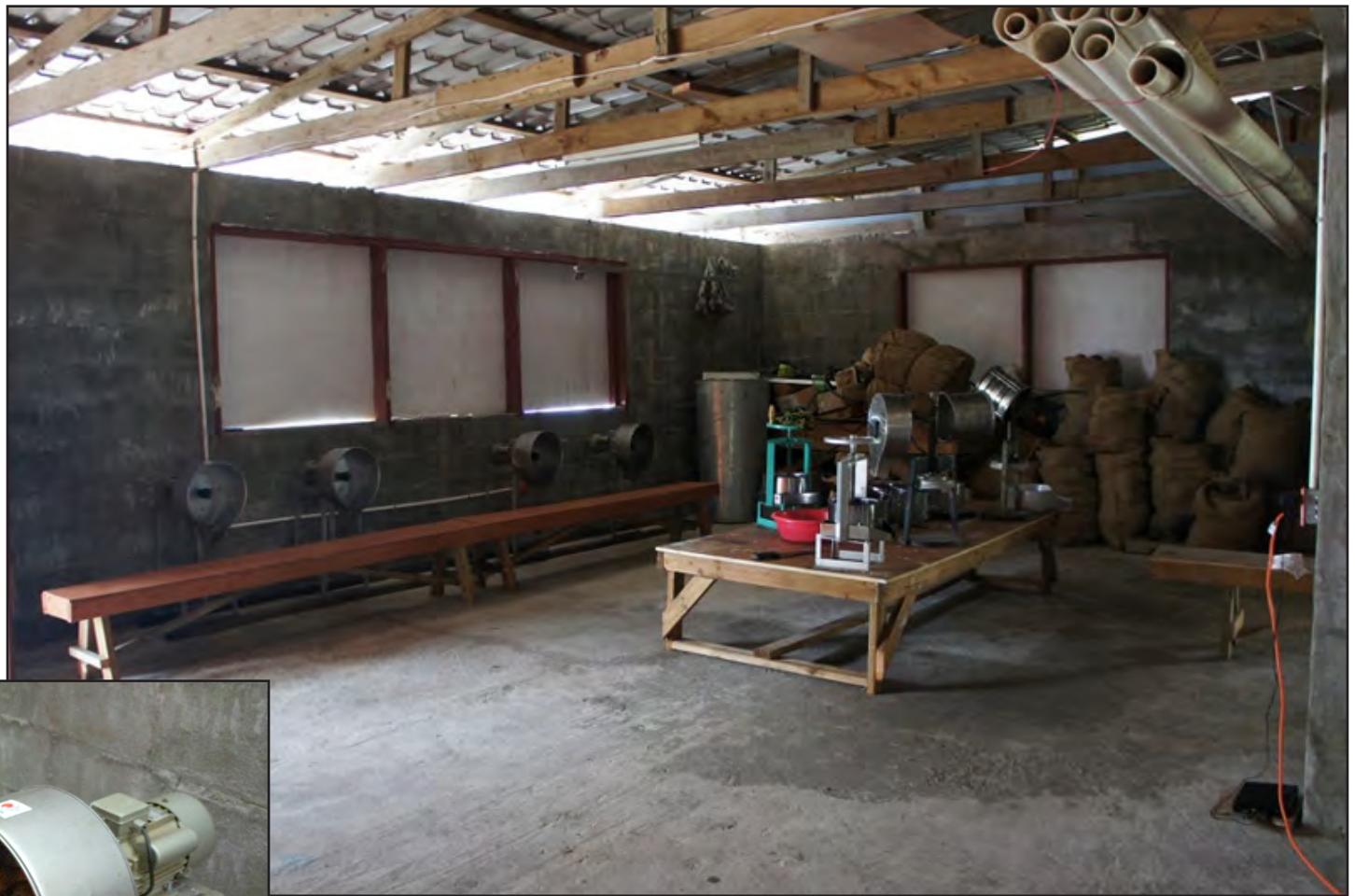
Oil production building funded by GGP