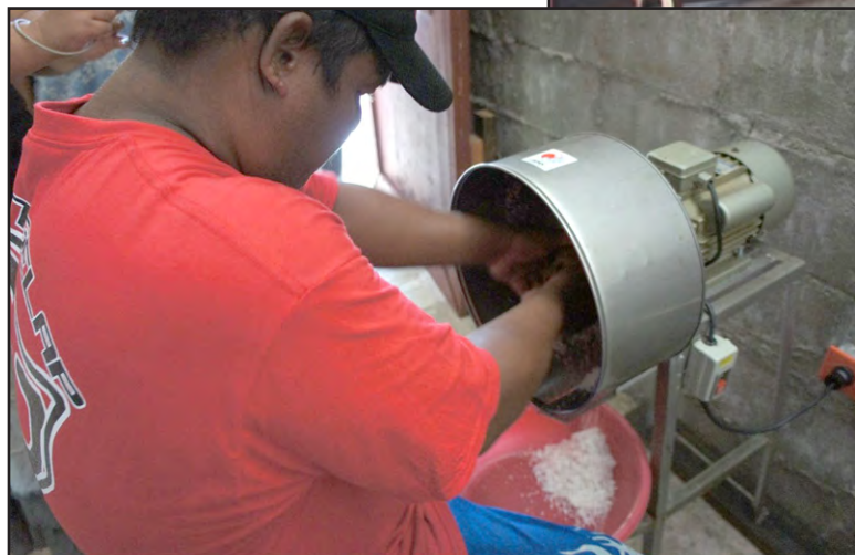
Grating coconut meat using coconut grater funded by GGP