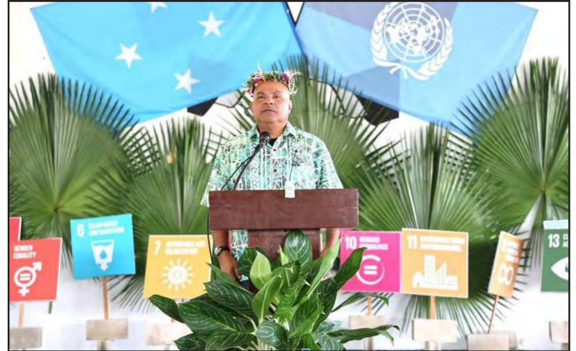
President Panuelo describes the FSM's commitment to human rights

In the meeting with differently abled citizens, President Panuelo received advice that the FSM National Government may find it useful to subsidize scholarship programs specifically focused on training teachers with an emphasis on children with special needs. The President has since instructed the FSM Department of Education to explore this.