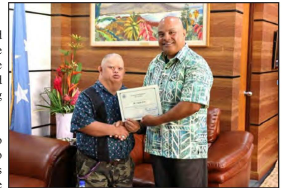
President Panuelo poses with a valuable member of the FSM's community of differently abled citizens