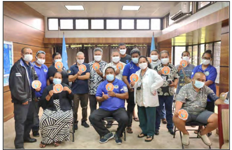
FSM National & Pohnpei State first responders pose at the conclusion of the COVID-19 vaccination launch event

Although the COVID-19 vaccine provides scientifically measurable and significant protection to individuals who receive it, it is not a “magic bullet”, it is not “literally a cure”, and it is not “a replacement for social distancing,” as some citizens