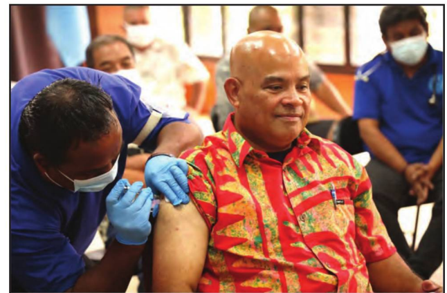
President Panuelo receives the COVID-19 vaccine