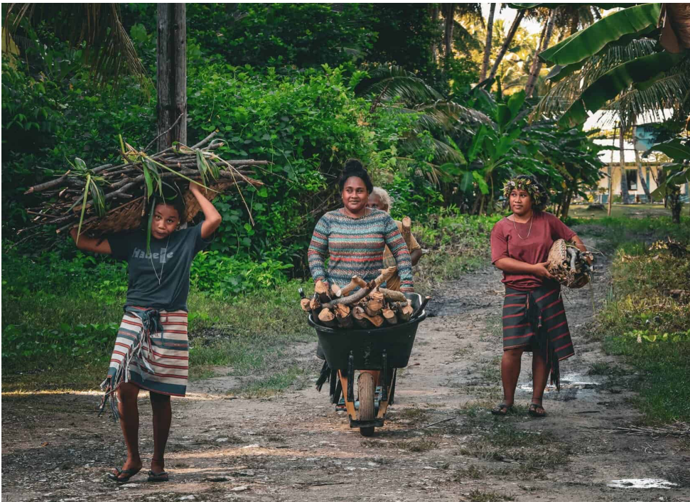
Women collecting firewood for cooking.