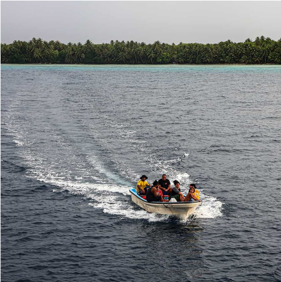
Passengers from Woleai bringing supplies from the island.

Kakala's sail: Voyage challenges energy norms