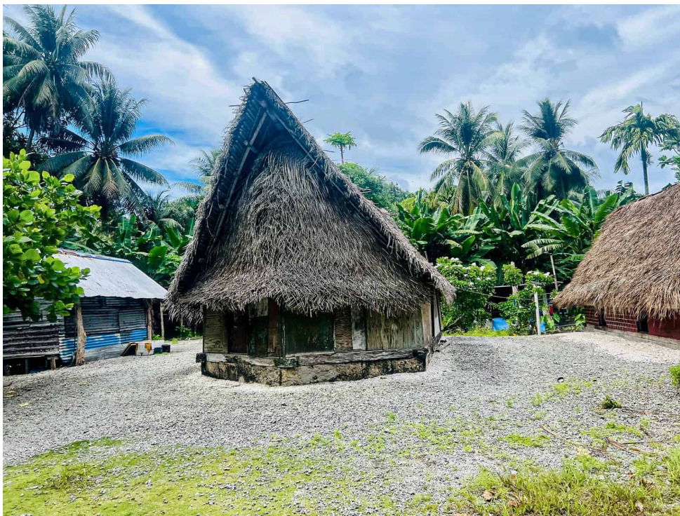
Traditional thatched homes on the island.

A solar power system was installed years ago to address these issues, but it has since become non-operational. Now, with support from the FSM Government, Yap State Public Service Corporation (YSPSC), the Pacific Community (SPC), and funding from the Australian Government, the system is being brought back online.