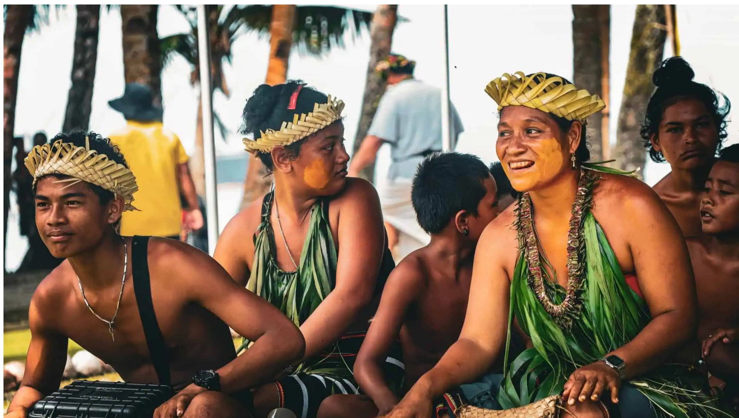
Local Woleai community welcome guests.