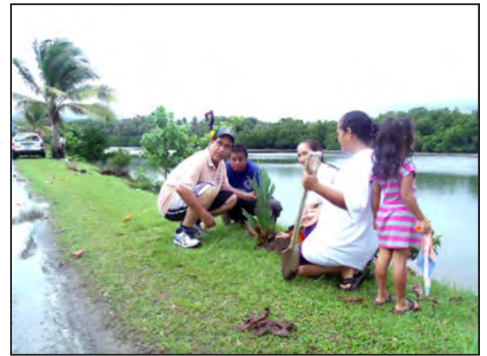
FSM President showed his support for the IFCP Fun Run at the Causeway

Division of Forestry Micronesian Conservation Trust Palm Terrace Police