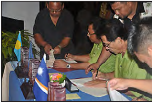
Endorsing the Ernguul Communiqué at Palau Pacific Resort