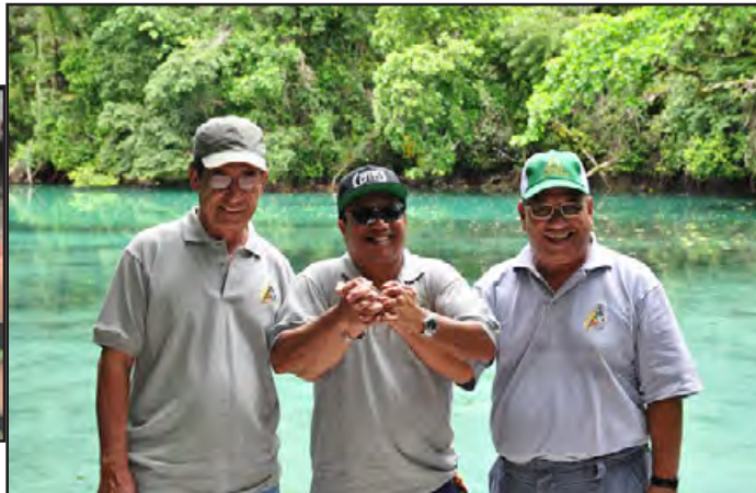
FSM President Manny Mori, Palau President Tommy Remengesau Jr., RMI President Christopher Loeak

Additionally, this year's Summit also provided the opportunity for the Presidents to collaboratively address new matters. For instance, two issues in direct relation to the United States Federal Aviation Administration (FAA) were raised, namely, the FAA Airport Improvement Project (AIP) discretionary funds eligibility and the recent FAA unilateral decision to transfer the Western Pacific Region from the jurisdiction of the FAA Los Angeles office to its International Affairs Office in Tokyo. On the former, the Presidents sent a joint letter to the US Government seeking support for the extension of AIP eligibility beyond 2015 to maintain overall aviation security and contribute to other industries and transport services that rely on efficient air transportation system. With regards the latter, they directed their transportation officials to further seek clarification from FAA on possible changes in level of assistance to Micronesia as a result of the shift in terms of responsible office from Los Angeles to its Tokyo-based International Affairs Office.