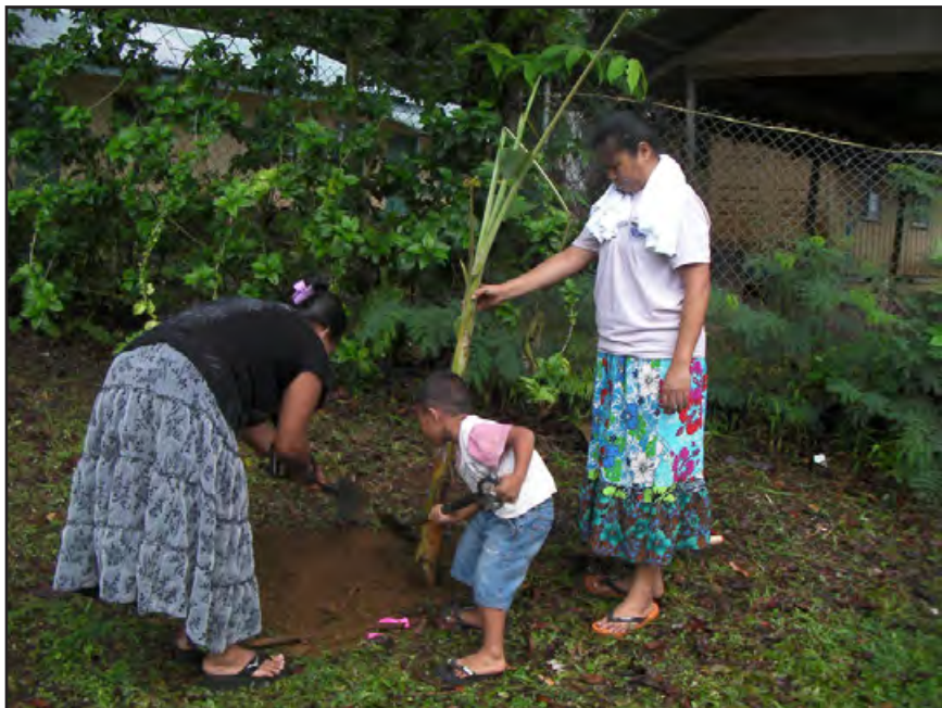
Volunteers planting at Kolonia Elementary School