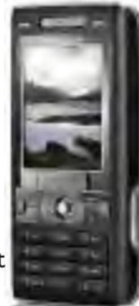
SONY ERICSSON K790i $528