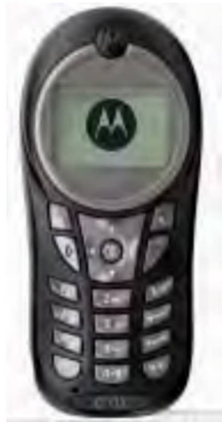
MOTOROLA C113 $49

Give the Gift of Communication with these great, affordable phones!