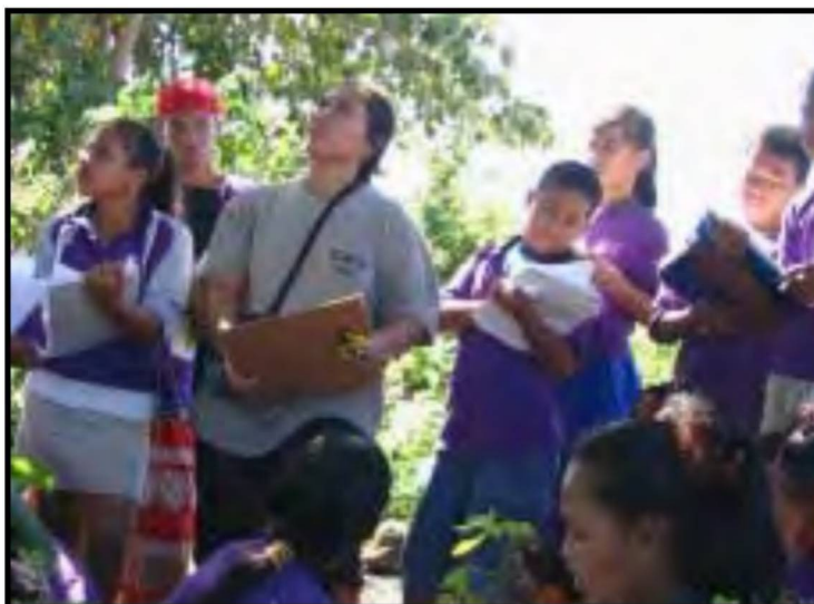
Sixth graders from Nett Elementary School enjoy a fun day outside the classroom learning about the procedures in collecting good plant specimens.

The AusAID grant of USD$6,370.00 will allow CSP to work with eight schools throughout Pohnpei on environmental