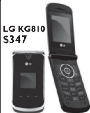
LG KG810 $347