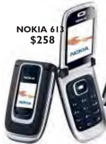
NOKIA 613 $258