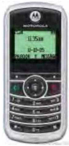
MOTOROLA C118 $59