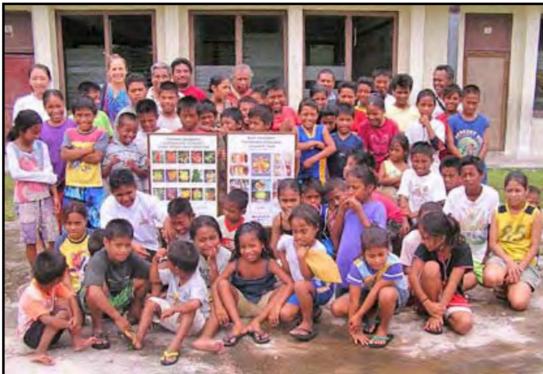
Pingelap Elementary School children and teachers and the IFCP team pose for a photo with the Pohnpei Banana and Carotenoid-Rich Foods Posters during the awareness session on January 6, 2007.

Planting material from eight varieties were collected and brought back for planting in the taro genebank collection at the FSM