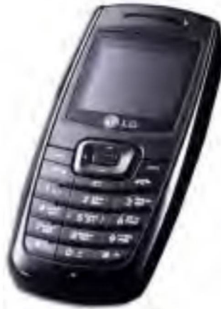
LG KG110 $83