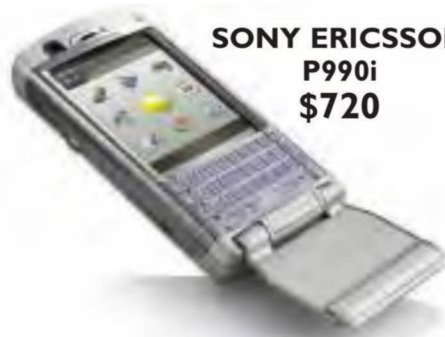
SONY ERICSSON P990i $720