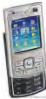
NOKIA N80 $564