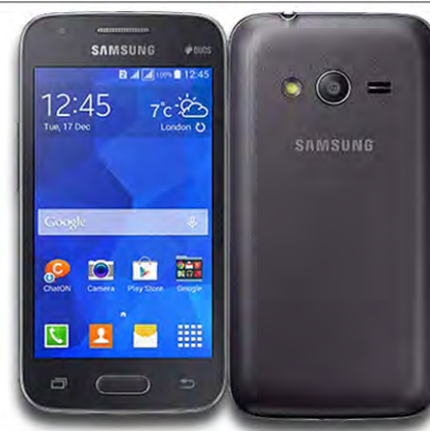
Galaxy Star 2 G350