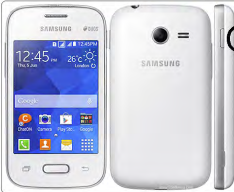
Galaxy Pocket G110