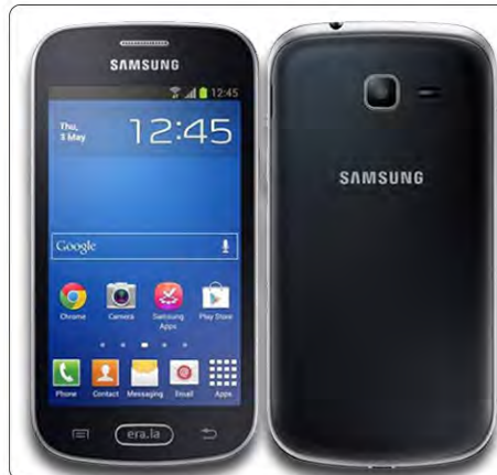
Galaxy Trend Lite S7390