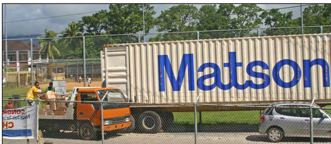
Volunteers help offload the 10,000 crocs from Matson's 40 foot container.