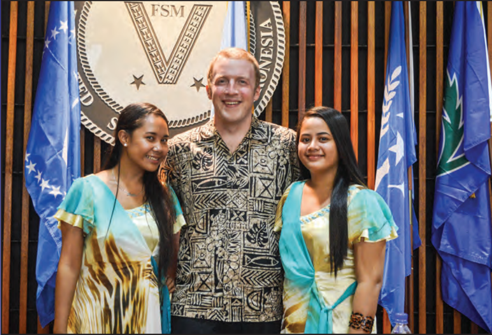
2015 National Law Day Winners - Team Kosrae