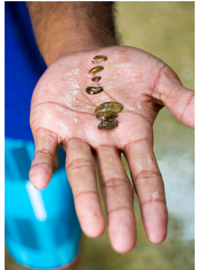
Sea Cucumbers not quite ready to be moved to the farm.

for the sea cucumber harvest. His area of expertise is the study of how best aquaculture can be performed for maximum economic benefit. He said that he has no knowledge about the populations of sea cucumbers in the wild. Anecdotally he said that he had noticed that in the last year it has taken much longer to find brood stock in the ocean. His program has permission to harvest sea cucumbers in the wild for spawning purposes.