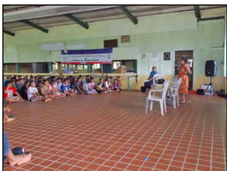
Pohnpei/Kosrae Catholic Youth summer camp