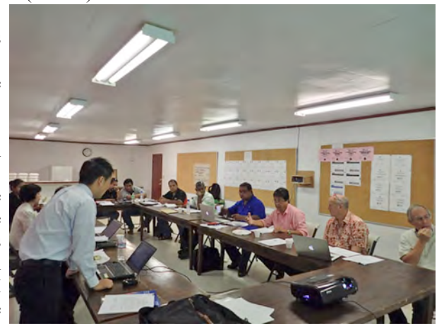
Project contents discussion with representatives from Dept. R&D, CPUC, PUC, KUA, YSPSC, JICA Survey Team and JICA Staff

"The Hybrid Island Initiative" which was launched at PALM7 in May 2015 by JICA aims to improve hybrid grid system for fossil fuel reduction and energy security. Since the renewable energy supply is unstable, the right balance between fossil fuel with appropriate operation and renewable energy can give stable supply and reduce the fossil fuel consumption. In line with this "the Hybrid Island Initiative", the project has been set up and will target in FSM, RMI, Fiji, Kiribati and Tuvalu within the Pacific Region for five years.