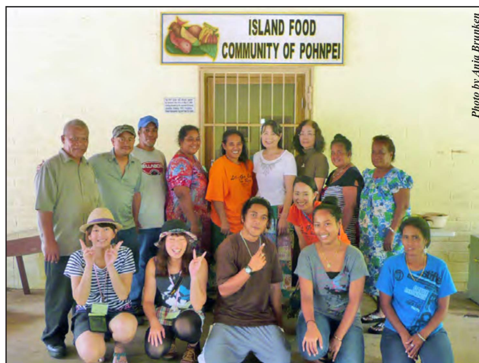
Rainbownesia Project Bento Tour at IFCP

Acknowledgments are given to Pohnpei State Government Subsidy, the US Embassy, UNESCO, Division of Public Health of Pohnpei Department of Health Services, Children's Healthy Living Program (University of Hawaii) and the Japan International Cooperation Agency (JICA) for their funding support.