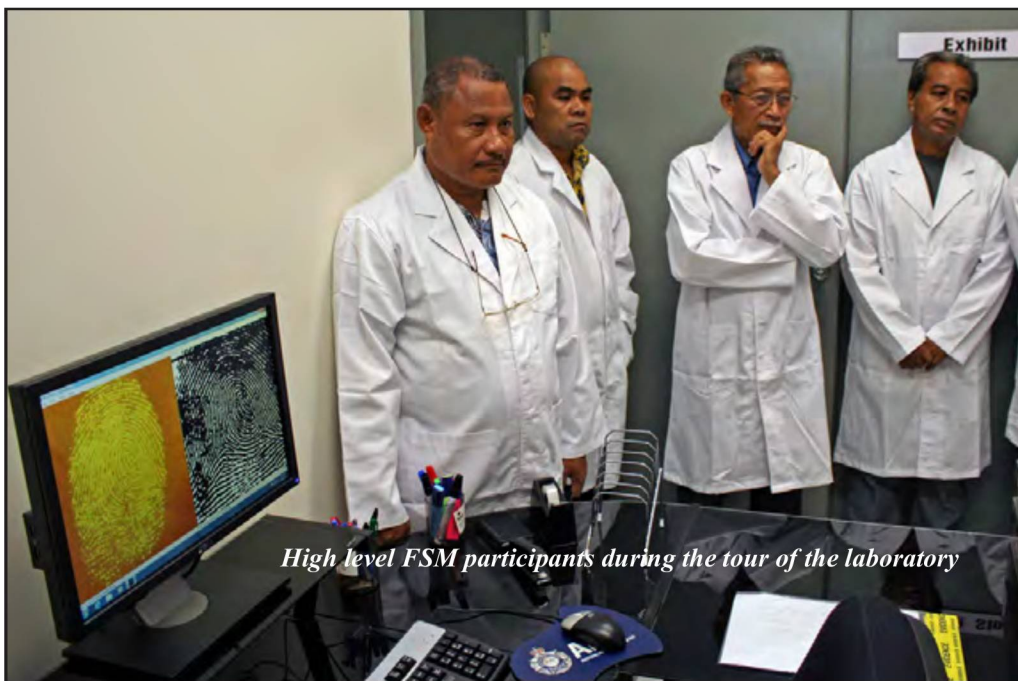
High level FSM participants during the tour of the laboratory