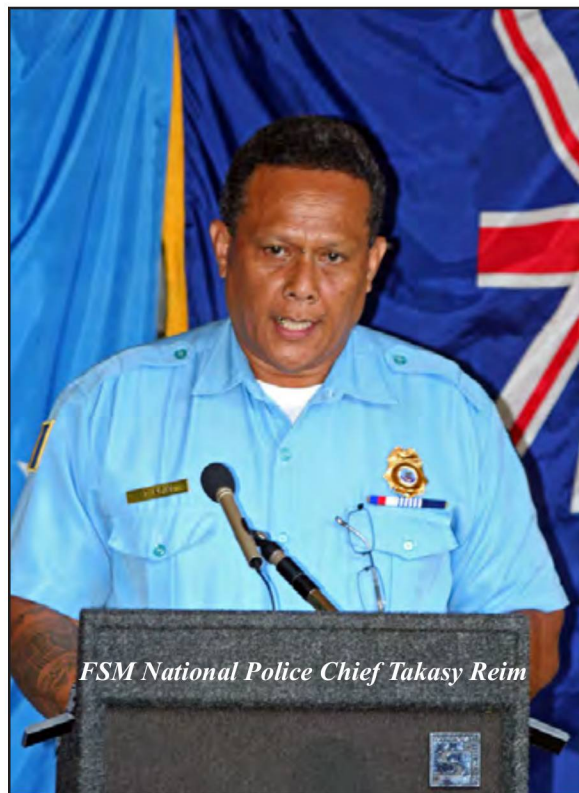
FSM National Police Chief Takasy Reim