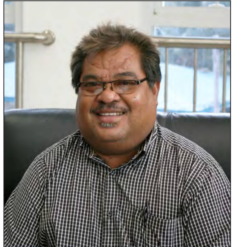
See “PUC” on page 10