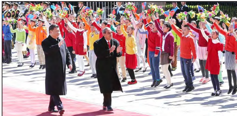
Chinese President Xi Jinping (L, front) holds a welcome ceremony for Micronesian President Peter M. Christian before their talks in Beijing, capital of China, March 27, 2017.

On March 21, 2017 President Christian and his delegation traveled to China's northern