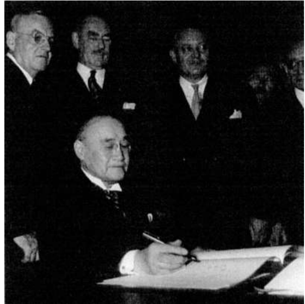
Yoshida Shigeru signs the San Francisco treaty as John Foster Dulles (left), Dean Acheson and Styles Bridges, the ranking minority member of the Senate Armed Forces Committee, look on

From signature of the trusteeship agreement until 1951, the islands of Micronesia were placed under civilian administration by the US Department of the Interior, except for most of the Marianas, which were soon returned to the Navy, and remained under Naval administration until 1961.[101] Some parts of the Marshalls also remained a closed area under Naval administration, and continued to be used for nuclear testing. The Northern Marianas, except Rota, were also closed, for use as a CIA training ground for guerillas to be landed in China.[102] However, in the whole Trust Territories of Pacific Islands (TTPI) consisting of more than 2000 islands, the number used for such military-related activities was very small, and there was no specific plan for using the others. For the USA, the greatest significance of the trusteeship was probably that it prevented enemies from using these islands' strategic potential.[103] The general public, including Americans, were not allowed to visit the islands, and inhabitants' travel overseas was also restricted.[104]