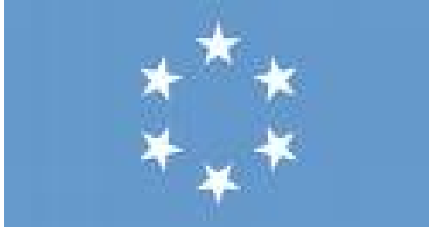
Flag of the Trust Territories of the Pacific Islands

the Second World War were all terminated. However, it took another fifteen years to terminate the TTPI.