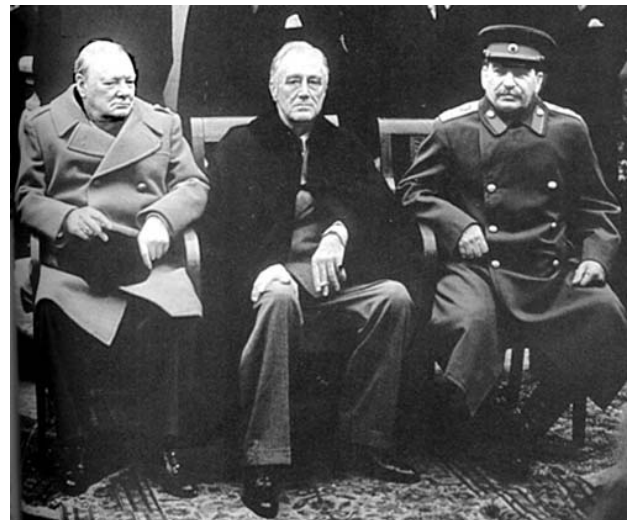
132. Winston Churchill, Franklin D. Roosevelt and Joseph Stalin meet at the Yalta Conference.

American occupation of the islands was complete before the Yalta Conference of February 1945. Beginning with invasion of the Marshalls, it was completed by a sweep through the northern Marianas by mid-1944.[4] Among agreements made at Yalta, relevant to the post-war disposition of these islands, were those on the UN and post-war trusteeship.