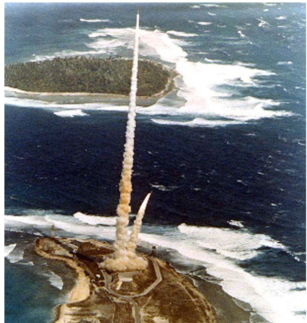
Kwajalein atoll test range

the Compact with the Marshall Islands allows continued use for up to thirty years of the US Army missile test range at Kwajalein atoll. Although post-TTPI arrangements were made, the trusteeship was not terminated until 1990. By Article 83 of the UN Charter, the trusteeship status of a strategic area can be altered only by UN Security Council resolution. Denouncing the Free Association system as “new colonial rule”, not to mention the Commonwealth arrangement with the Marianas, the USSR regularly vetoed the trusteeship termination resolution.[120]