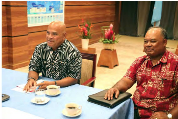
President Panuelo, joined by Secretary Elieisar, describes his views on a topic of import

Citizens unfamiliar with the politics of the PIF may appreciate the following summary. Analogous to the European Union or the African Union, while the MPS is the subregional gathering of Micronesian Presidents, the PIF is the regional entity representing the Pacific Island regions of Micronesia, Melanesia, and Polynesia, and historically has been used to promote regional solidarity