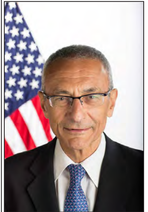
Embassy of the United States of America Kolonia

Counselor to the President John Podesta will lead a high-level U.S. government delegation to the Pacific Islands Forum Post Forum Dialogue (PIF PFD) on August 1 in Koror, Palau, to highlight and build upon our historic relations with the peoples and nations of the Pacific. The U.S. delegation will include senior officials from the National Security Council, United States Pacific Command, U.S. Coast Guard, Department of State, Department of the Interior, U.S. Peace Corps, U.S. Agency for International Development, and the State of Hawaii.