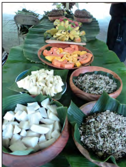
Local food served in locally handcraft wooden serving platters