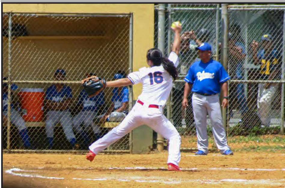
Baseball and Softball