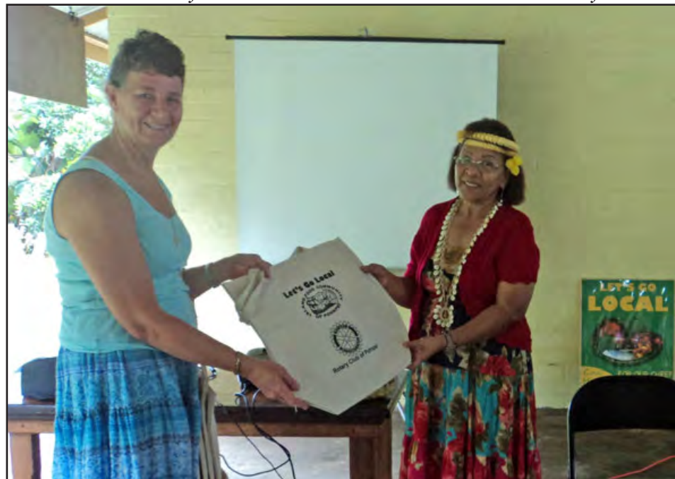
RMI First Lady receives a Go Local bag with her Local Fruit basket