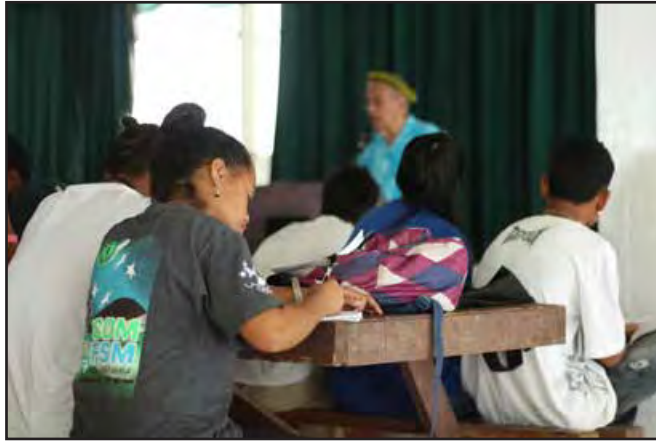
A Close-Up student takes notes

Students listened with varying degrees of attention. Some took notes while others examined their fingernails. As members of Close-Up, the participants in the lecture are the top students of the school.