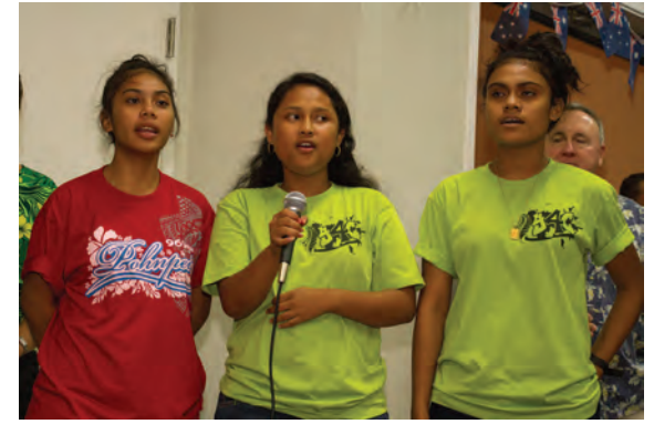
Youth 4 Change