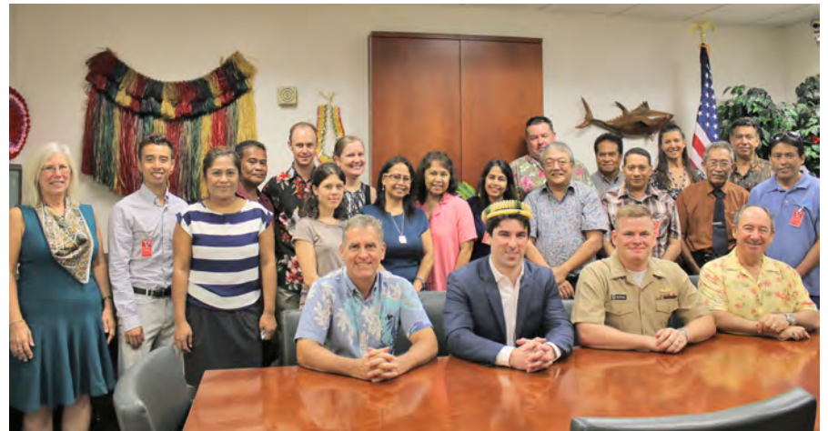
FSM national government, state government, Australian Embassy, and U.S. Embassy officials as well as close friends and family of LTJG Lawrence joined in the occasion