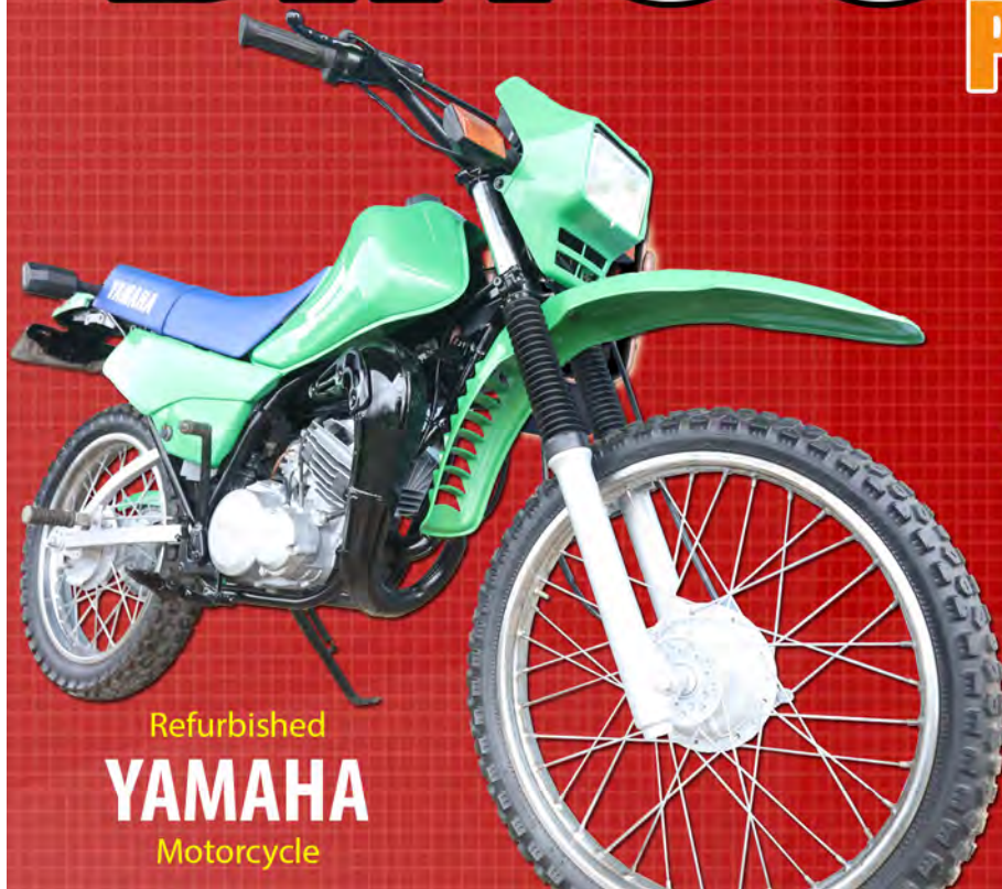
Refurbished YAMAHA Motorcycle