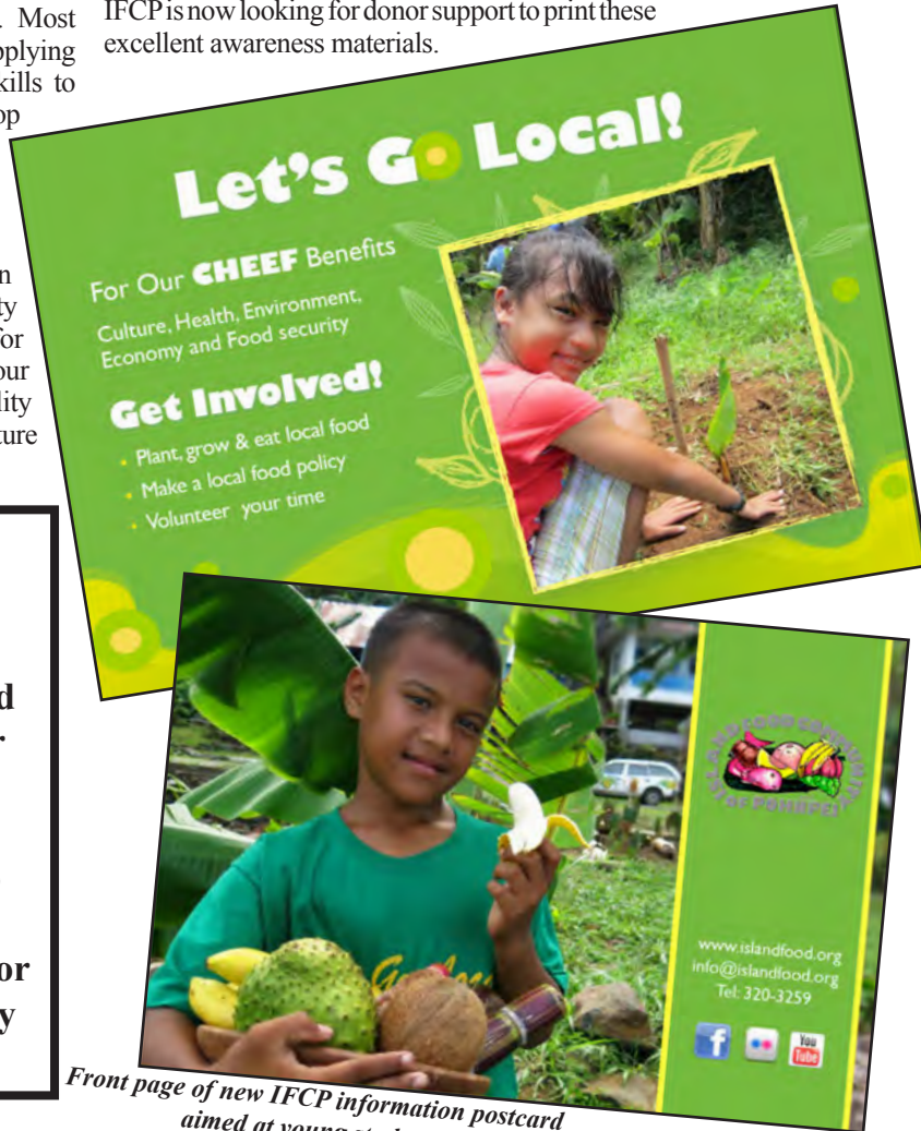
Front page of new IFCP information postcard aimed at young students

IFCP is now looking for donor support to print these excellent awareness materials.